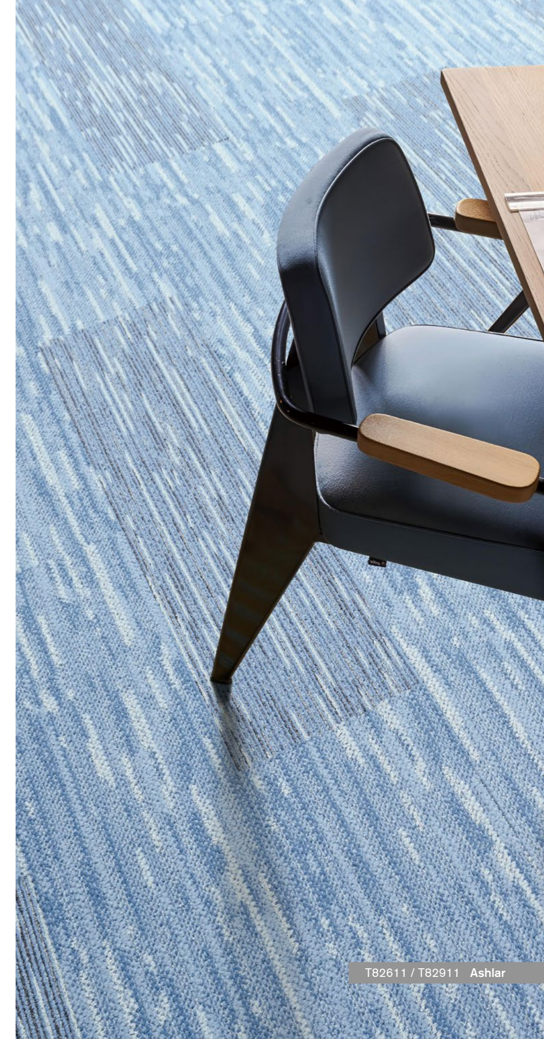
T82611 / T82911 Ashlar