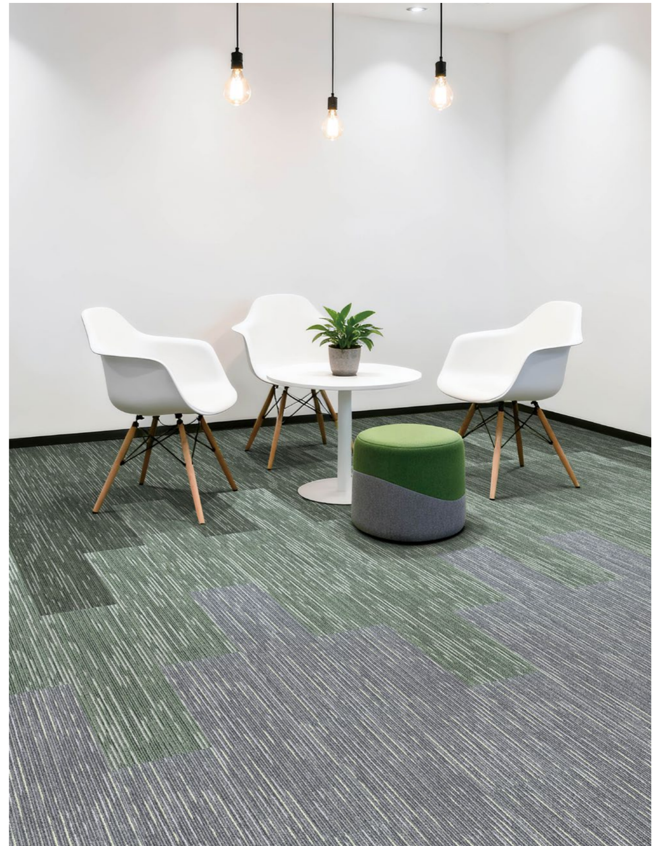
T82511 / T82623 / T82633 Ashlar