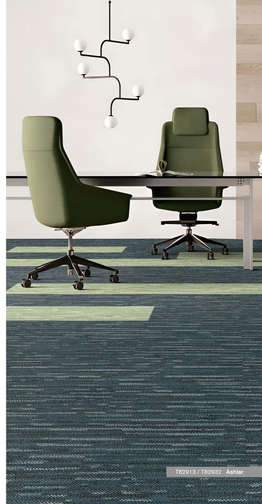
T82913 / T82932 Ashlar