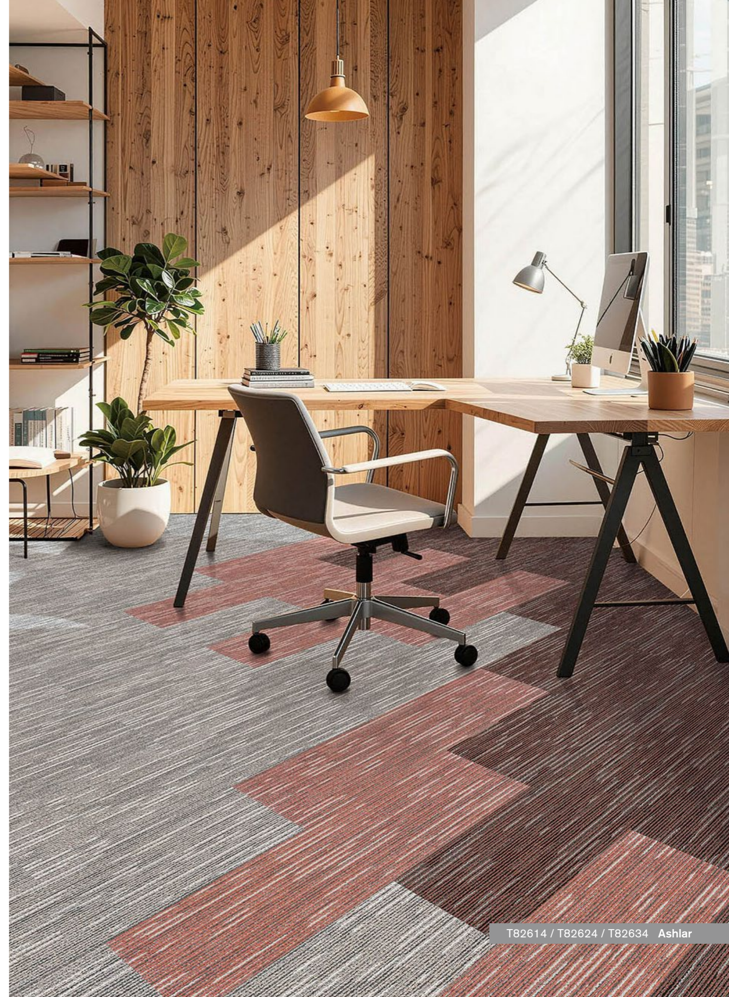
T82614 / T82624 / T82634 Ashlar