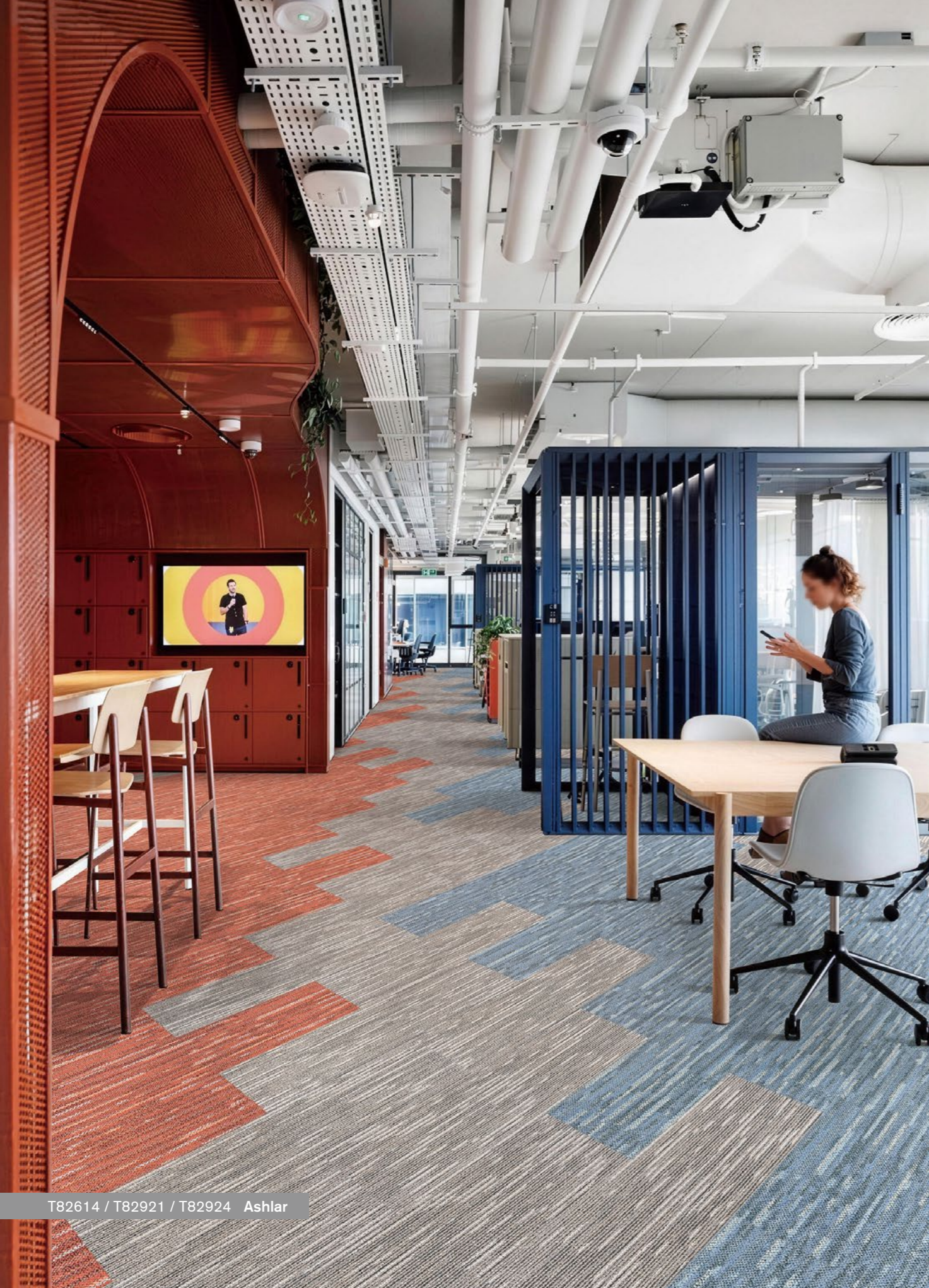
T82614 / T82921 / T82924 Ashlar