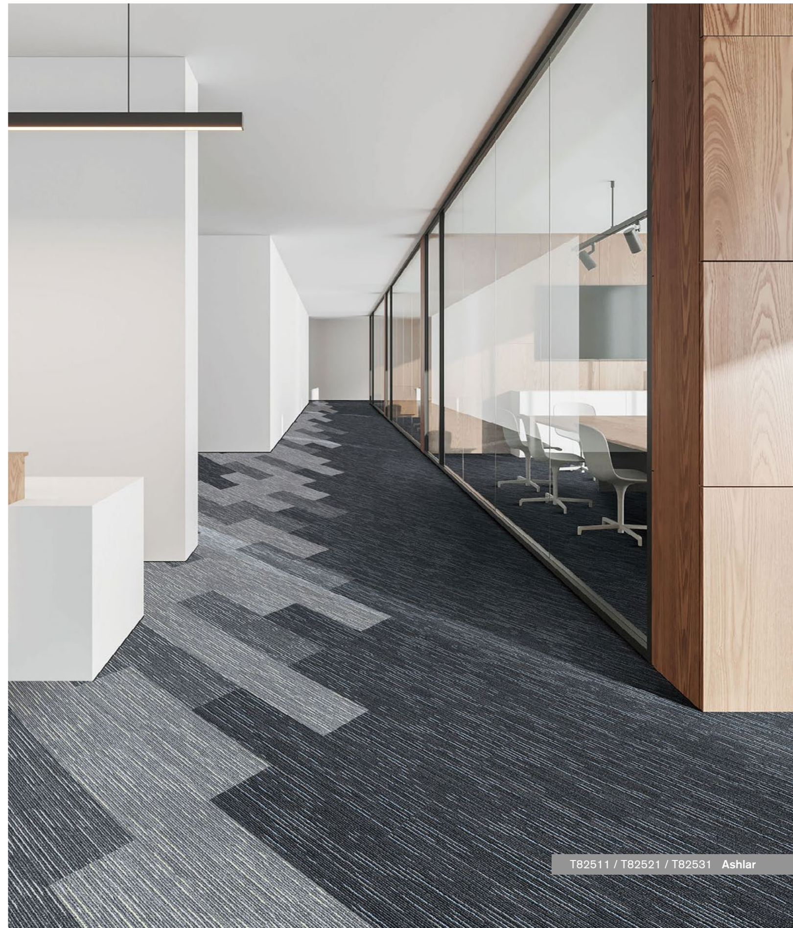
T82511 / T82521 / T82531 Ashlar