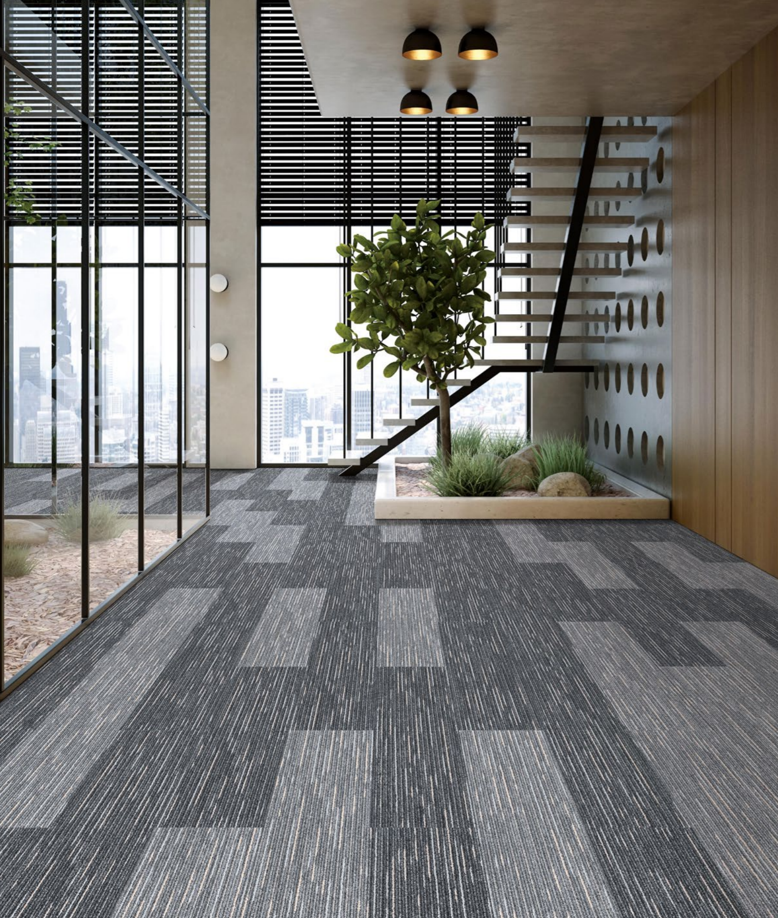
T82512 / T82522 Ashlar