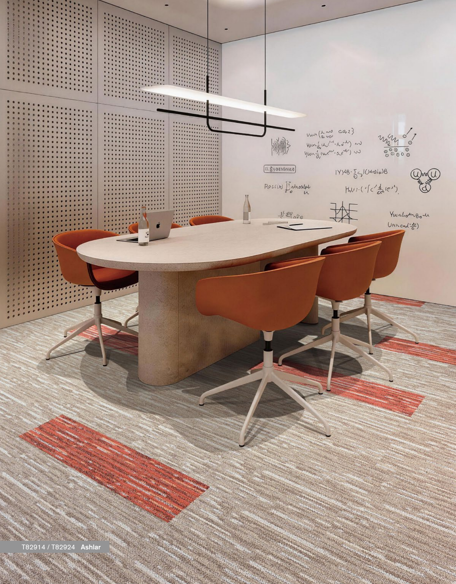
T82914 / T82924 Ashlar