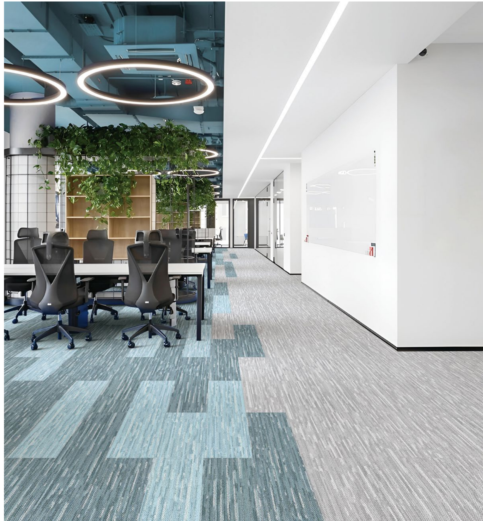
T82901 / T82912 / T82922 Ashlar