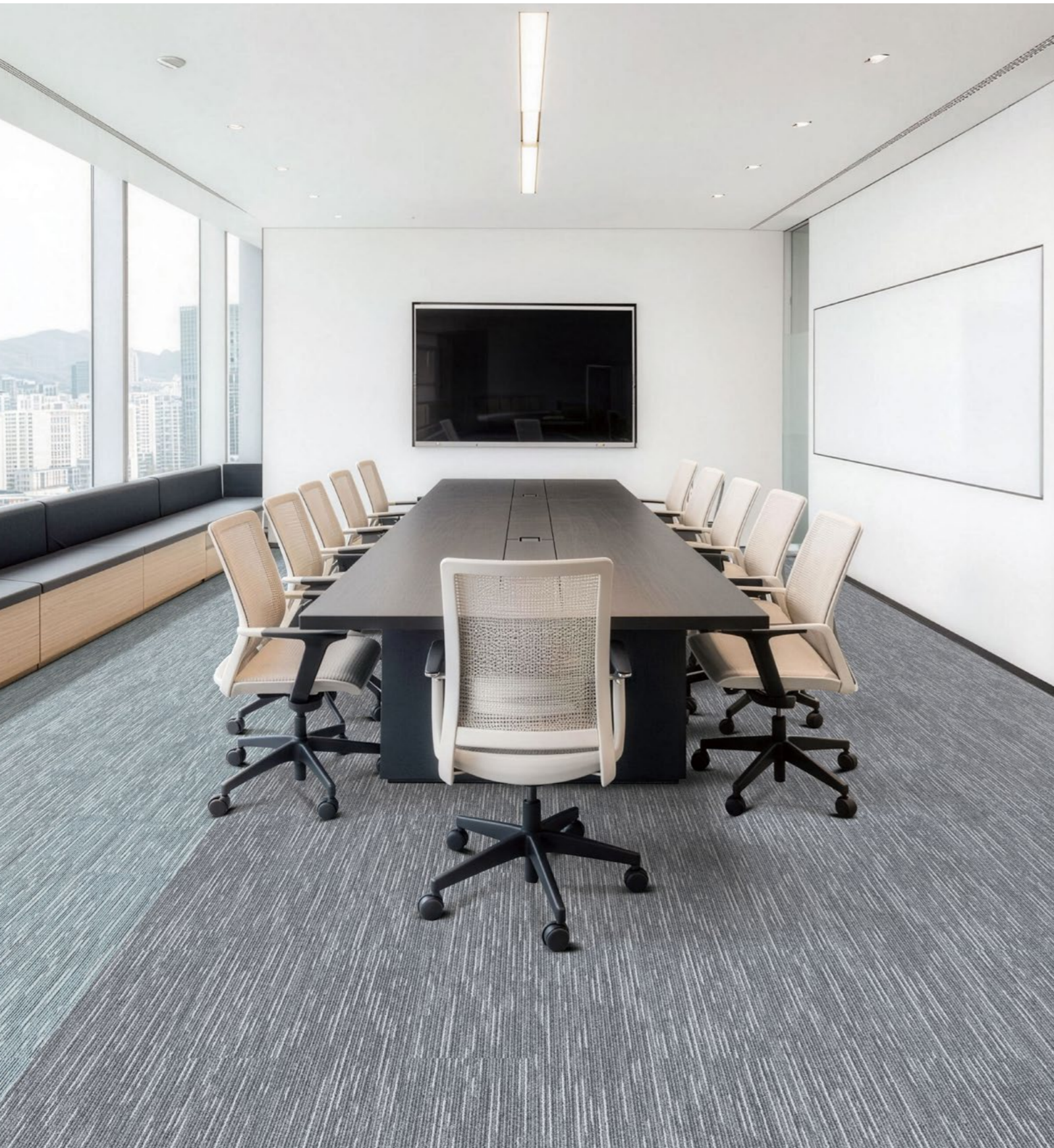
T82510 / T82612 Ashlar