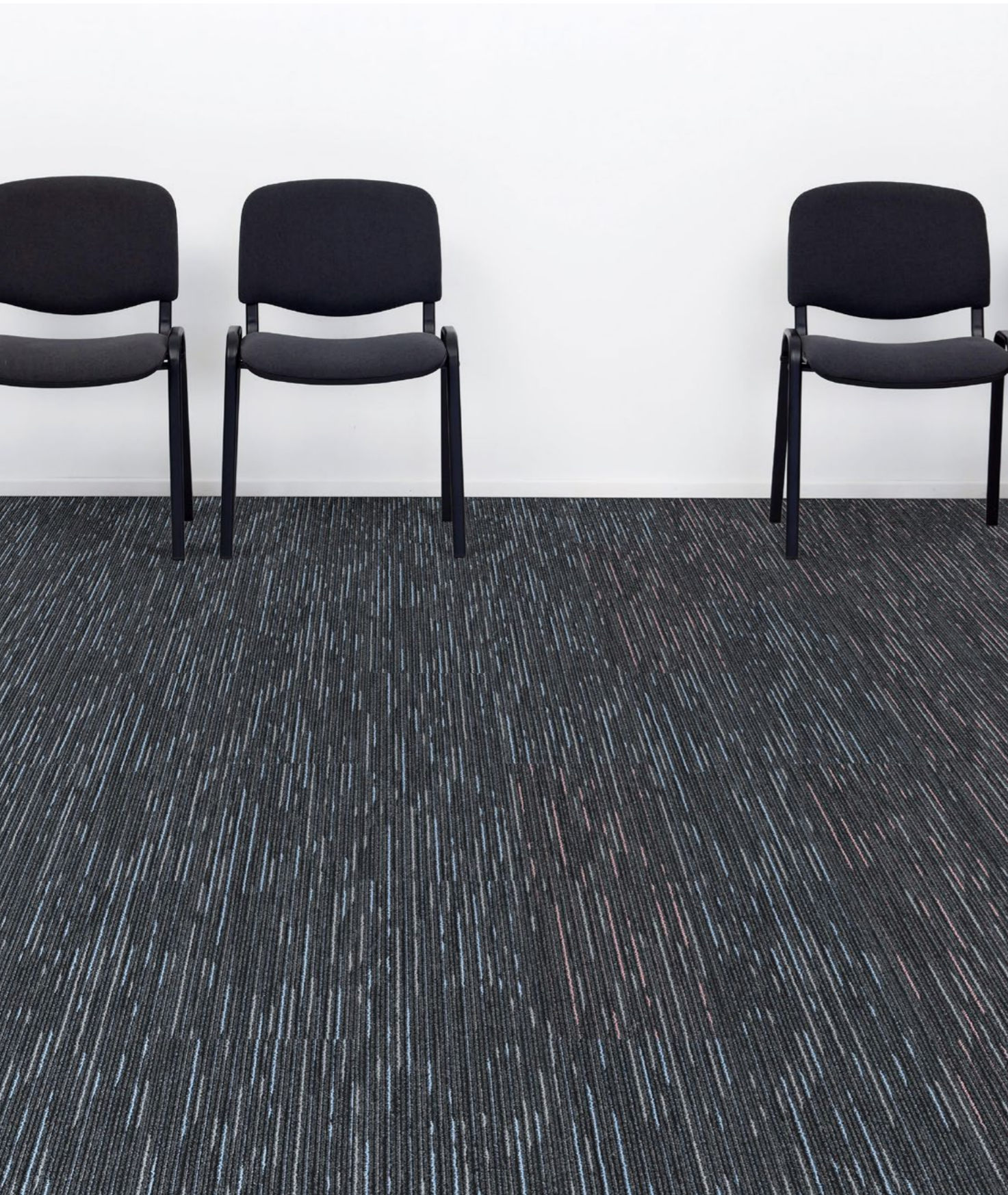
T82531 / T82532 Ashlar