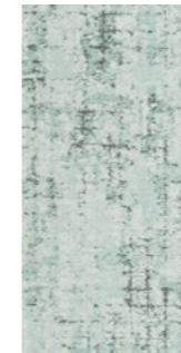
LA1506 Pale Green