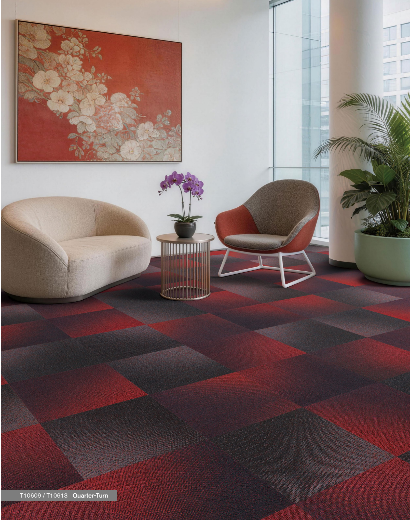
T10609 / T10613 Quarter-Turn