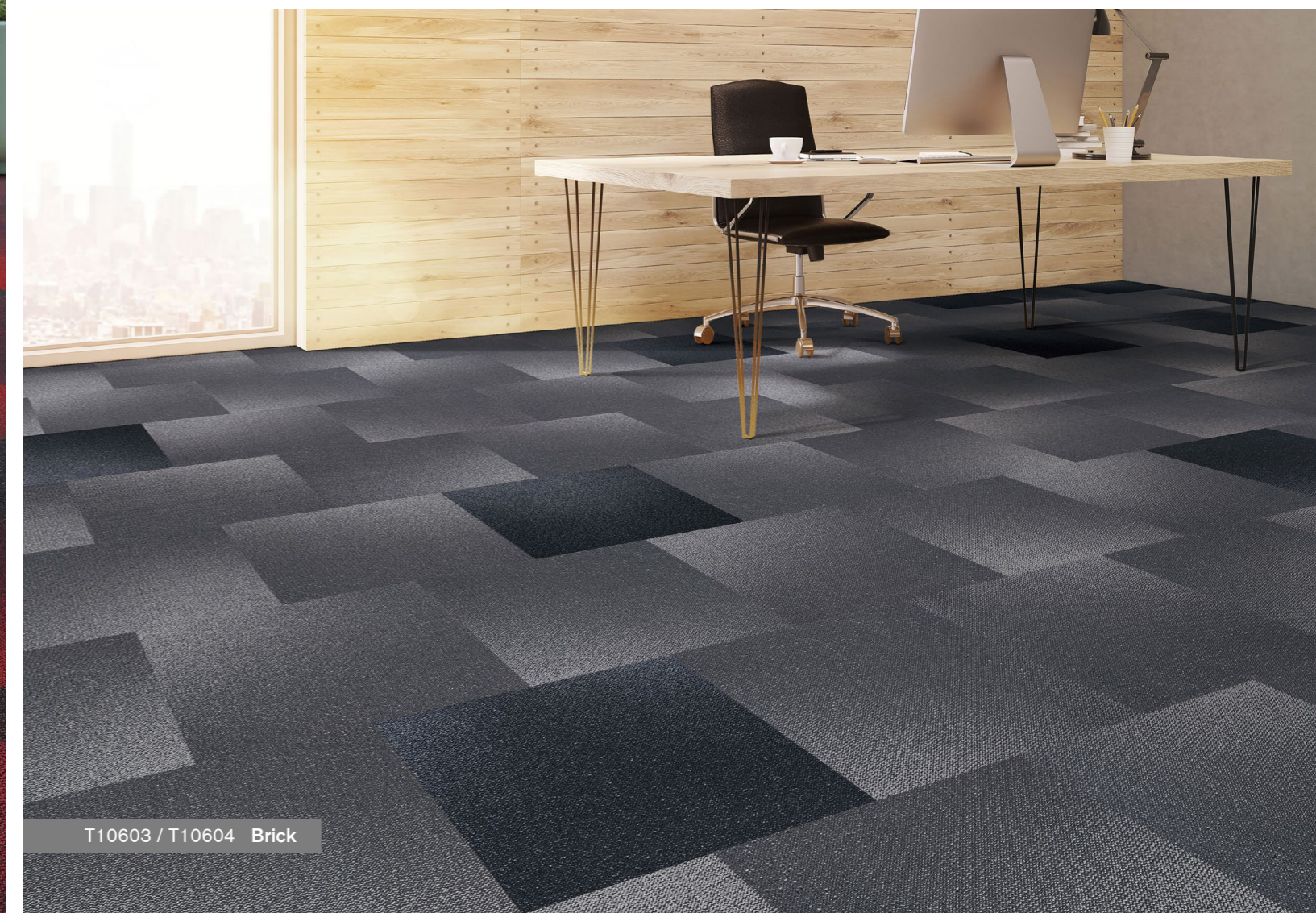
T10603 / T10604 Brick