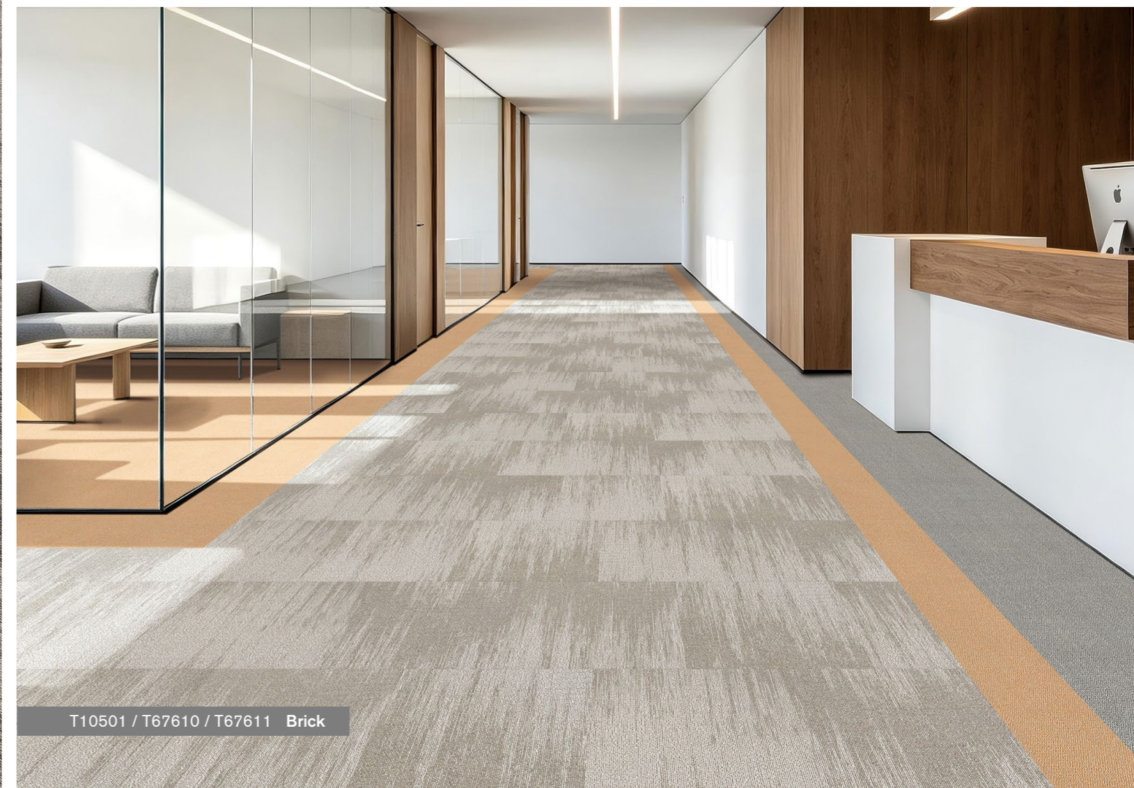
T10501 / T67610 / T67611 Brick