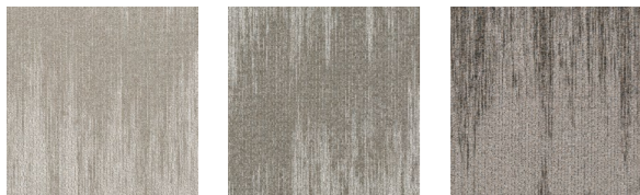
T10501 Sand Castle T10502 Hazel Wood T10503 Fawn