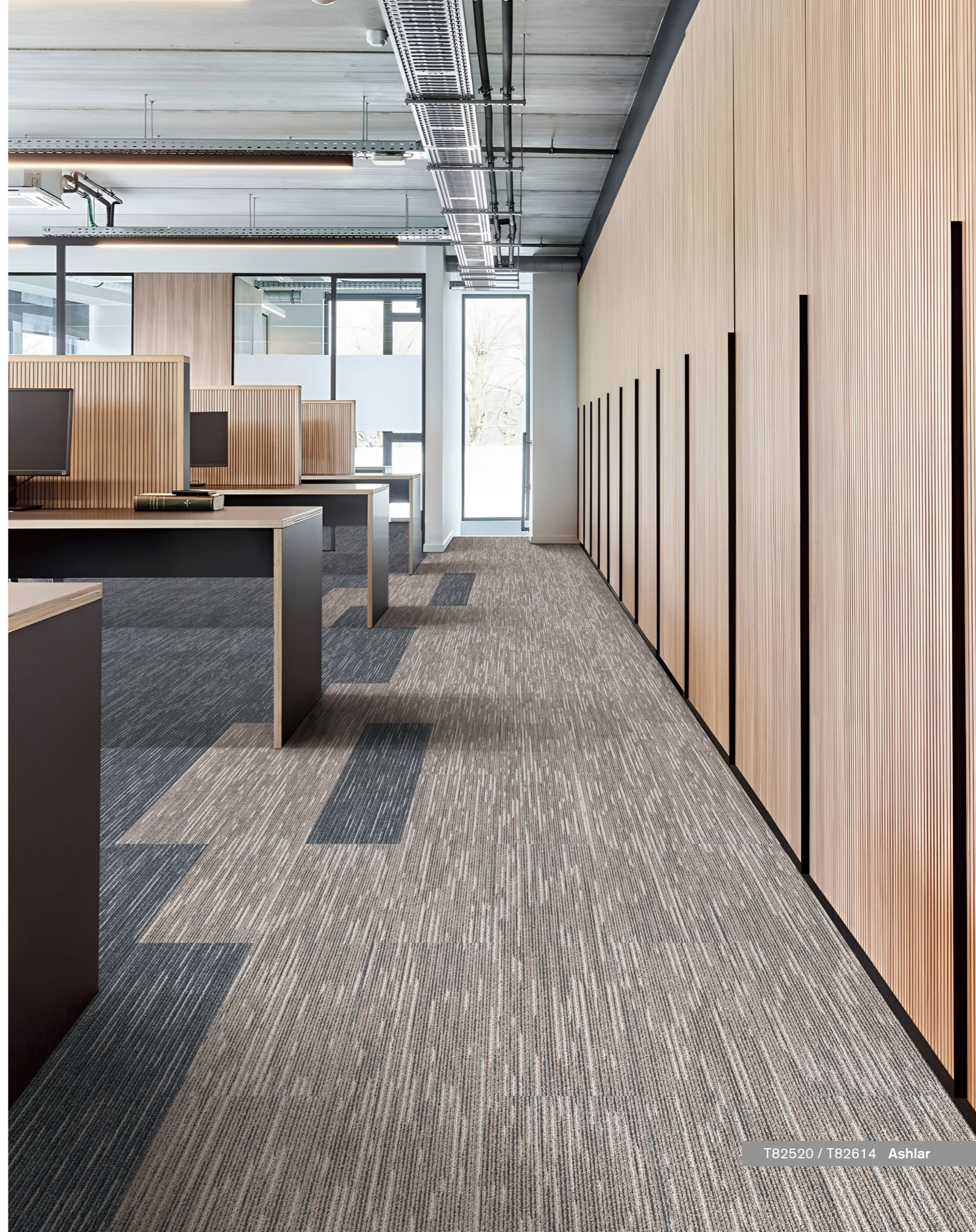
T82520 / T82614 Ashlar