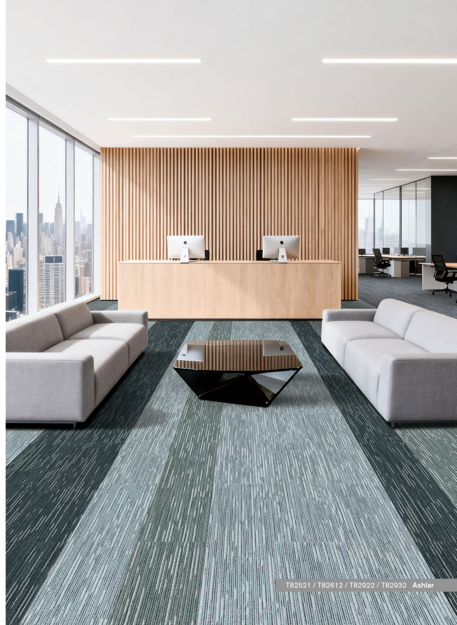
T82521 / T82612 / T82922 / T82932 Ashlar