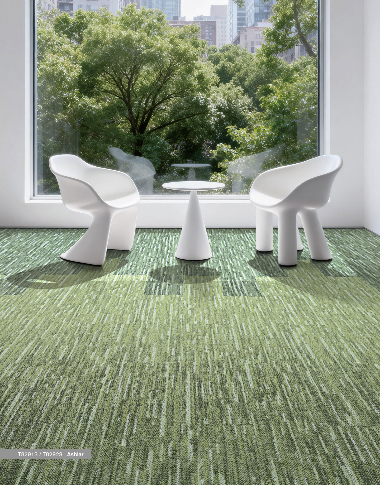
T82913 / T82923 Ashlar