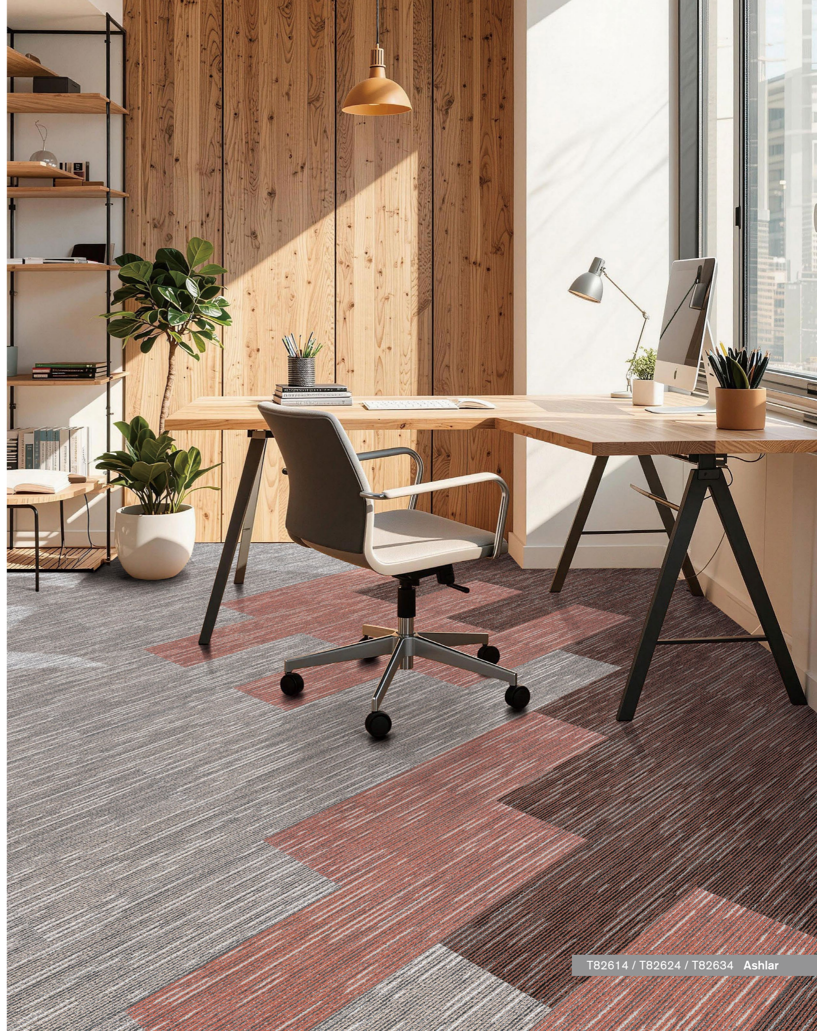
T82614 / T82624 / T82634 Ashlar