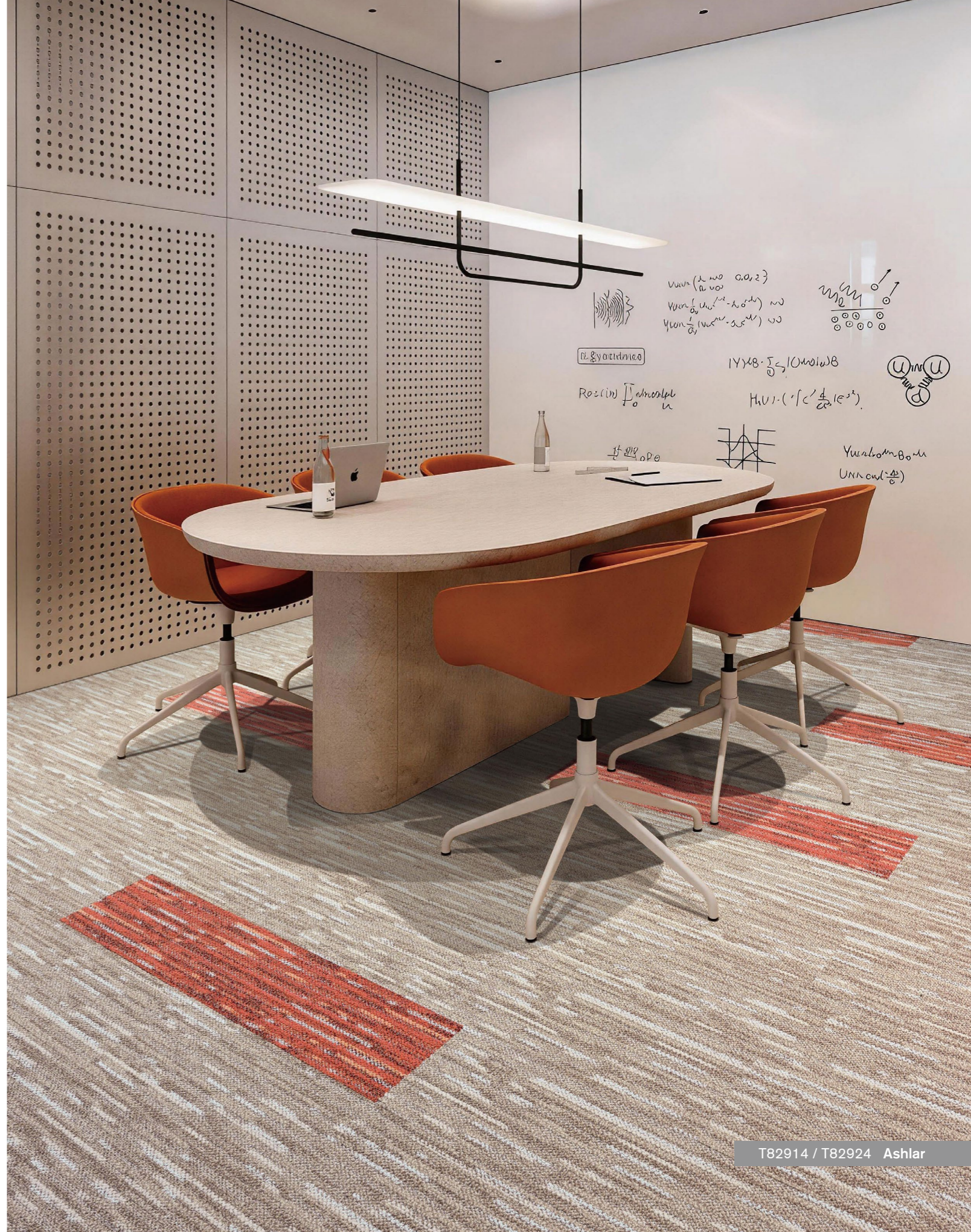
T82914 / T82924 Ashlar