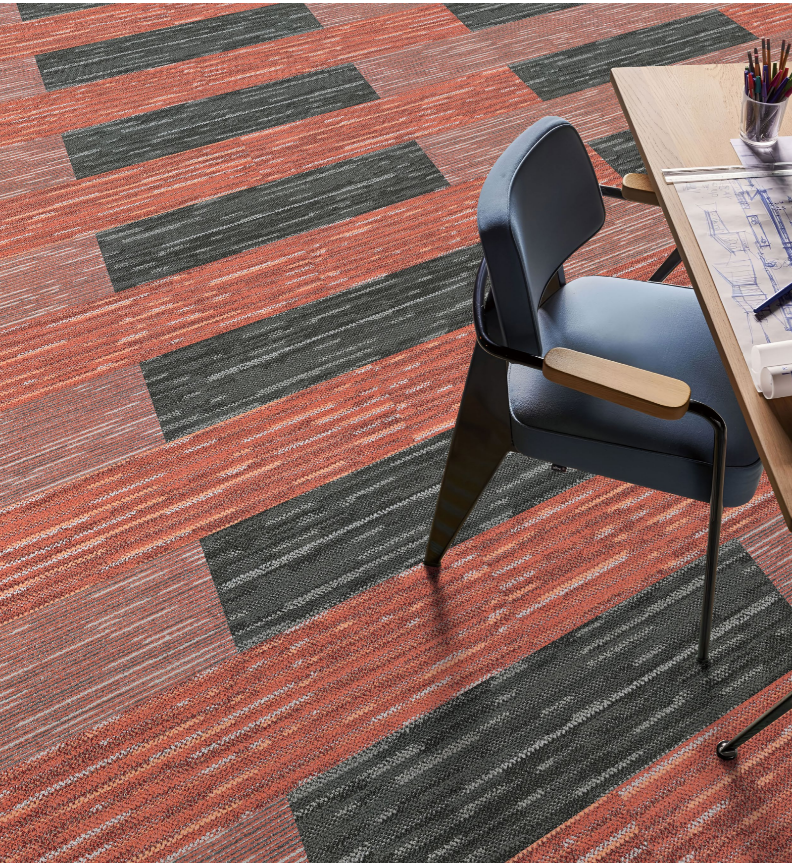
T82624 / T82903 / T82924 Ashlar