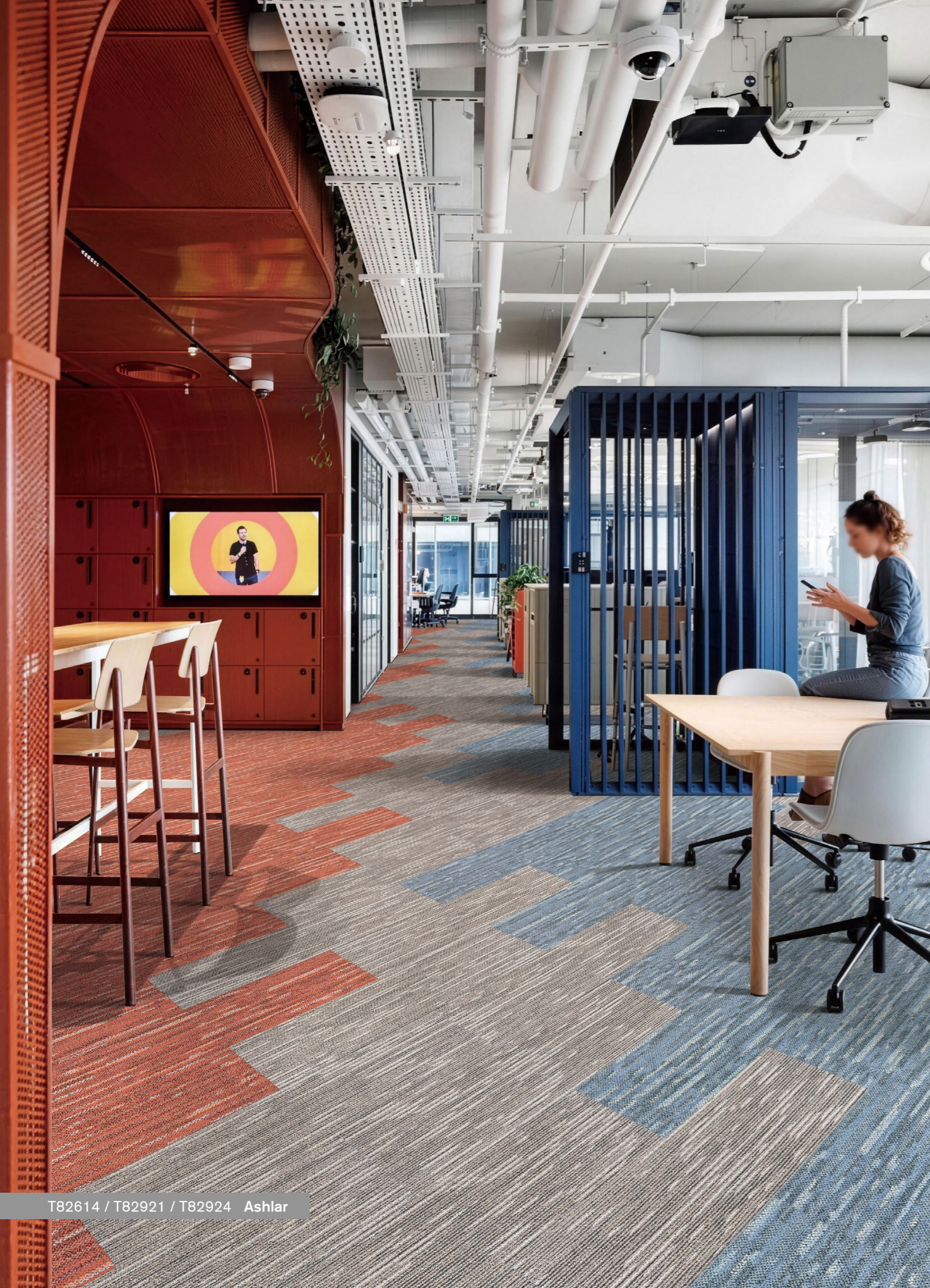
T82614 / T82921 / T82924 Ashlar