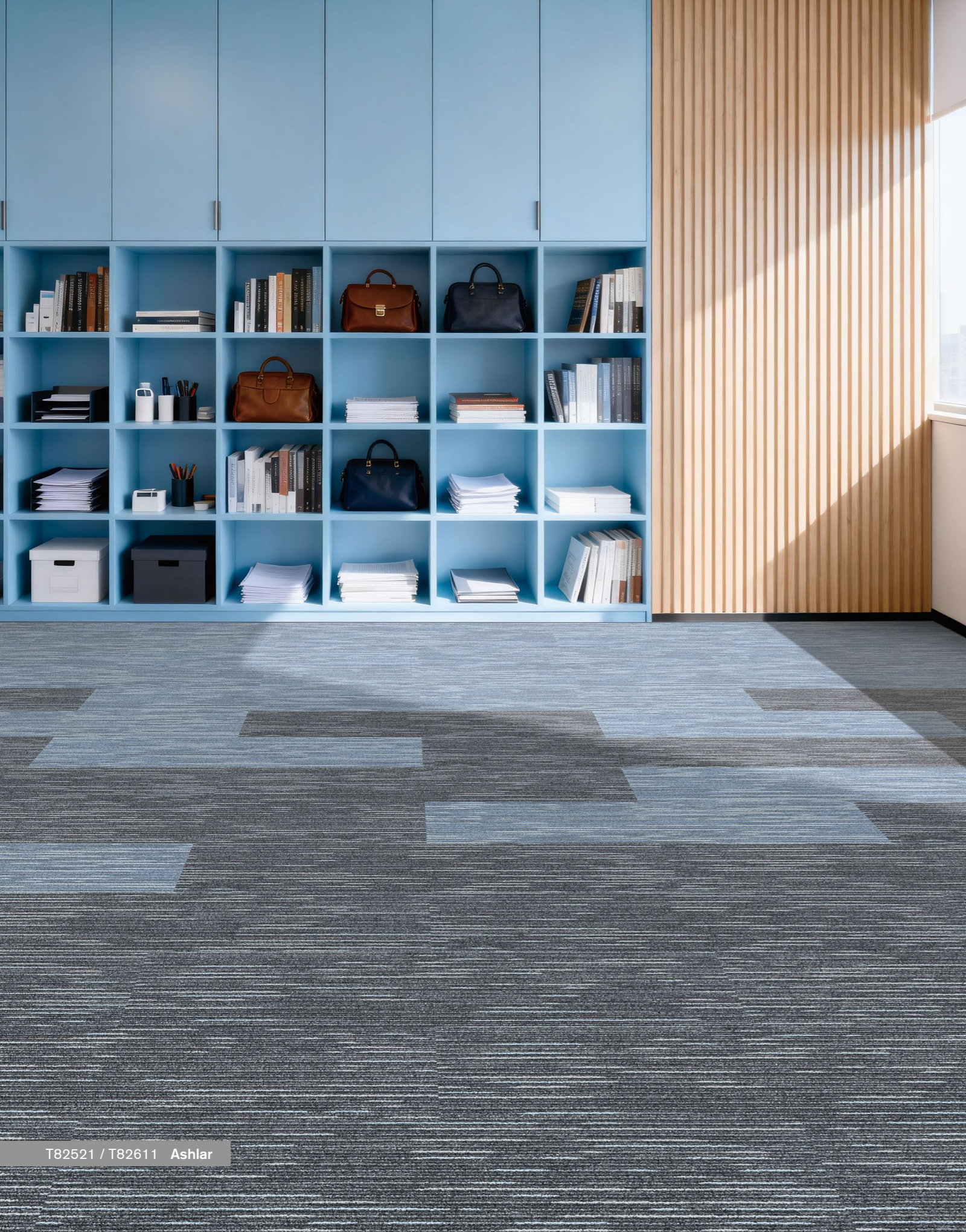
T82521 / T82611 Ashlar