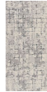
LA1502 Warm Soil