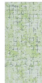
LA1507 Fresh Green