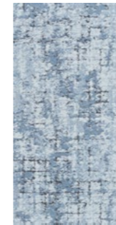
LA1505 Clear Sky