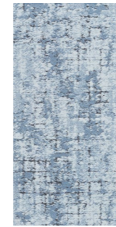
LA1505 Clear Sky