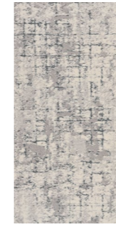
LA1502 Warm Soil