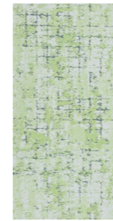
LA1507 Fresh Green