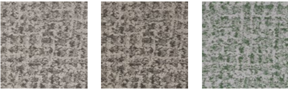
T72701 Cedar T72702 Coffee T72703 Green