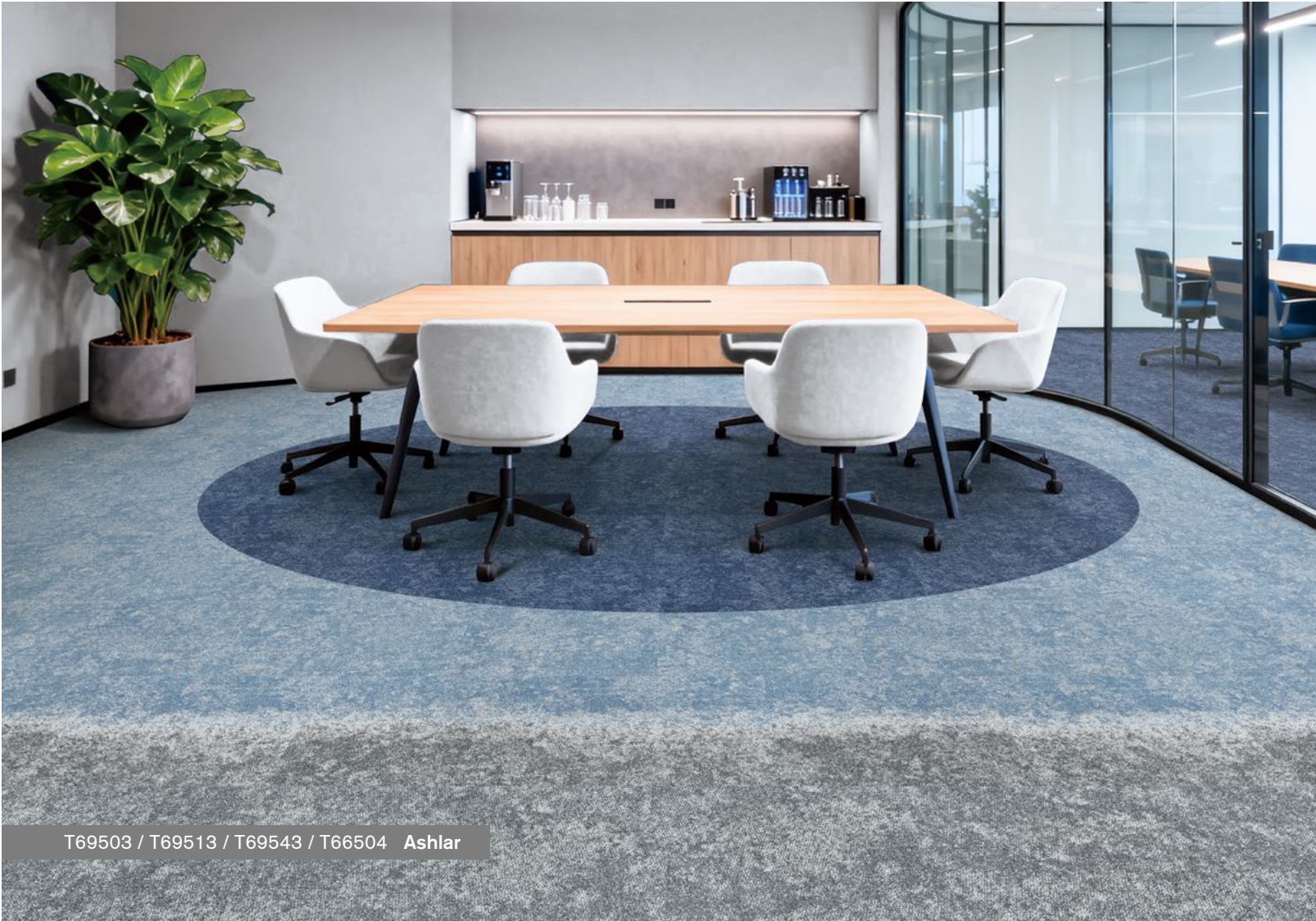
T69503 / T69513 / T69543 / T66504 Ashlar