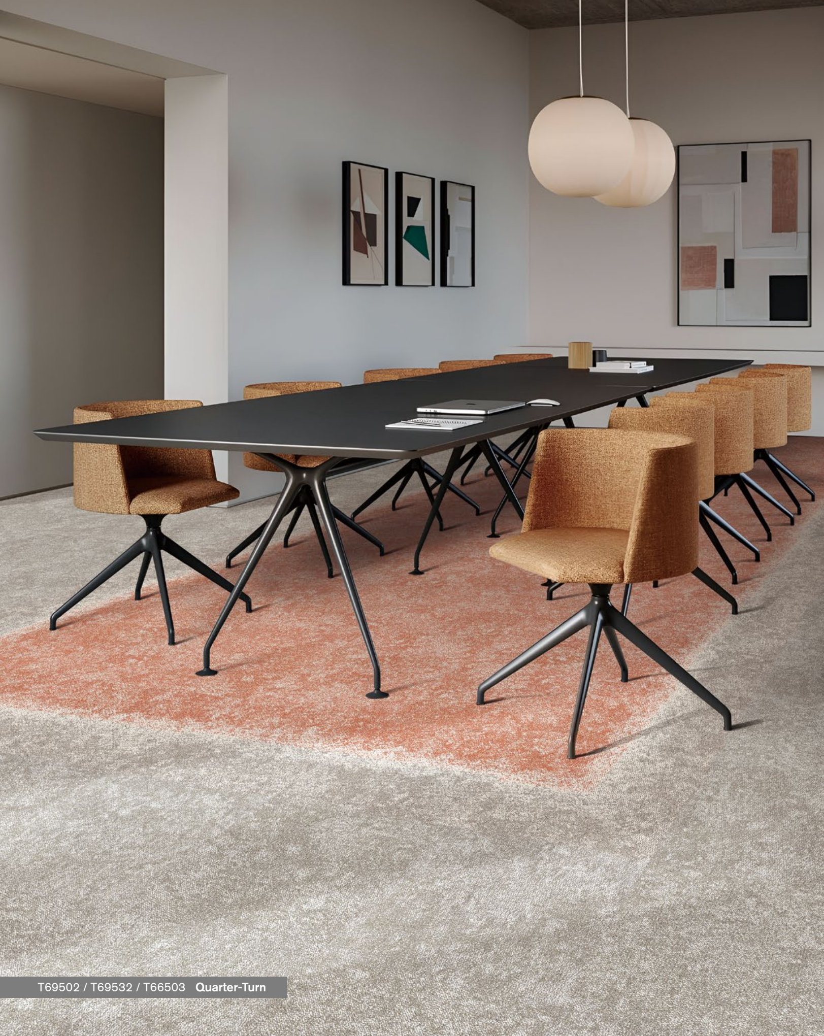
T69502 / T69532 / T66503 Quarter-Turn