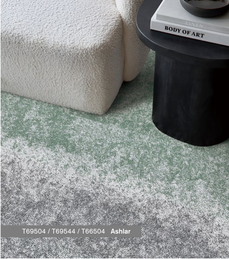
T69504 / T69544 / T66504 Ashlar

T695 Granite Play retains the natural stone texture of T665 Granite, enhanced with layered ombre tonal shifts to create dimensional calm through controlled color progression. By introducing gradual transitions between green, gray, and warm neutral tones, the design brings a sense of depth and soft movement to the textured aesthetic.