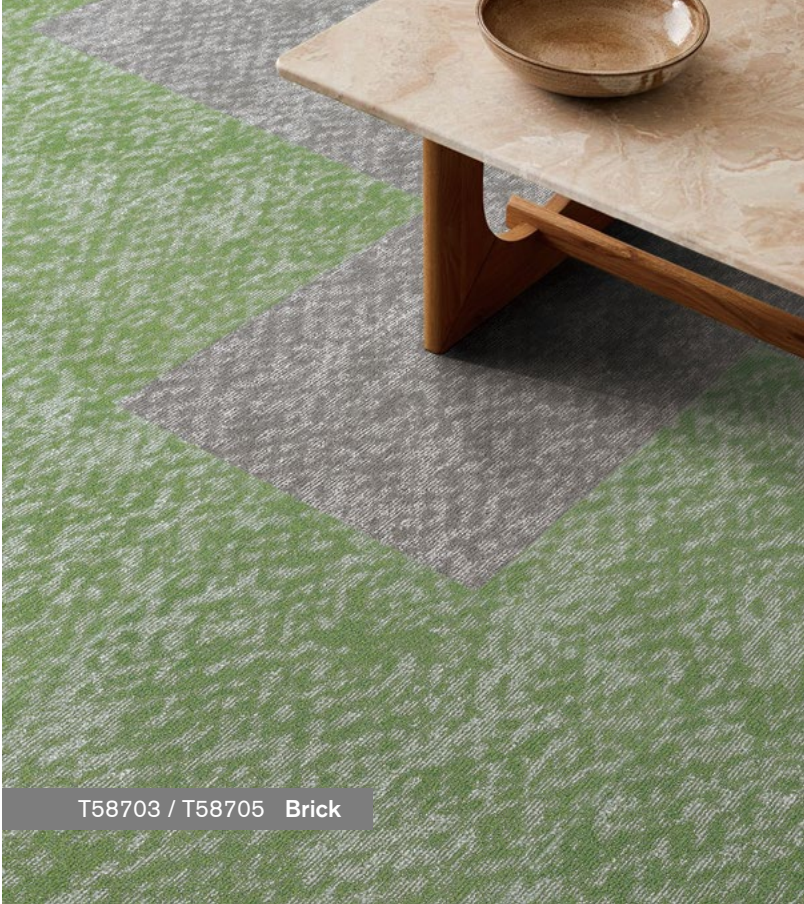
T58703 / T58705 Brick

Available in grid textures and a versatile palette of earthy tones, T587 Trellis ensures compatibility across diverse settings, offering a reliable solution where long-lasting performance meets practical beauty.