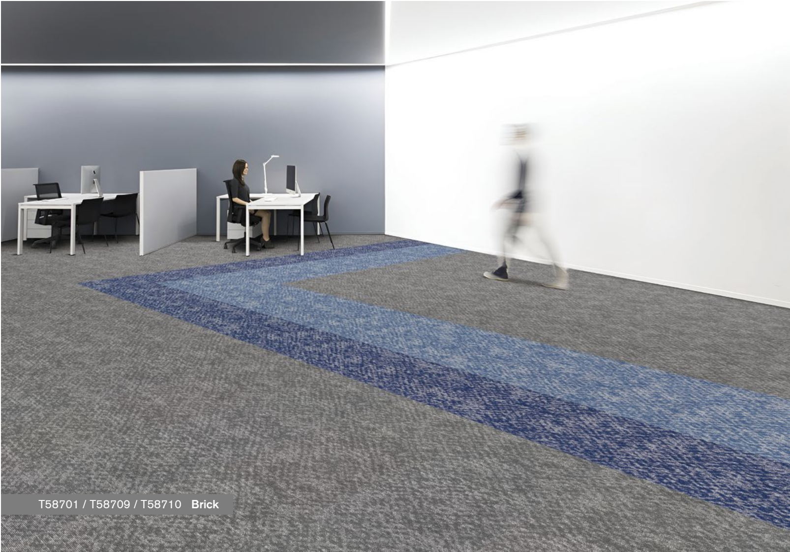
T58701 / T58709 / T58710 Brick