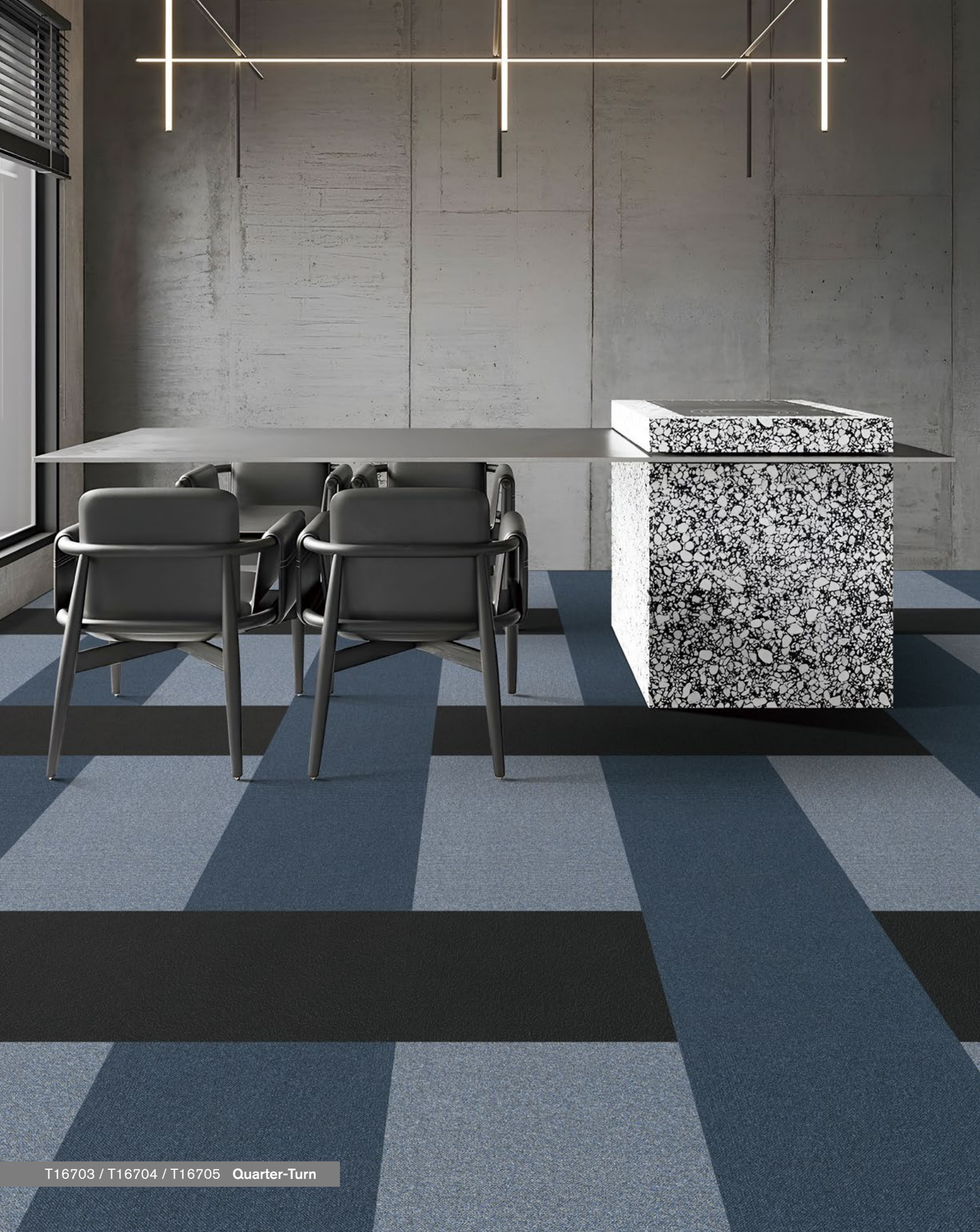
T16703 / T16704 / T16705 Quarter-Turn