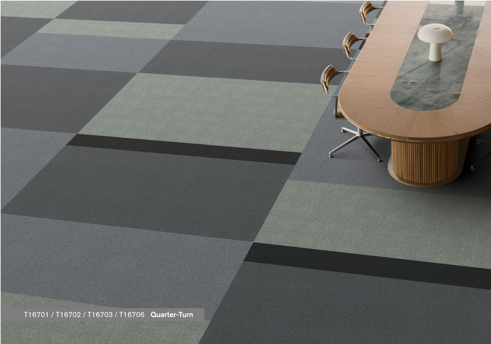
T16701 / T16702 / T16703 / T16706 Quarter-Turn