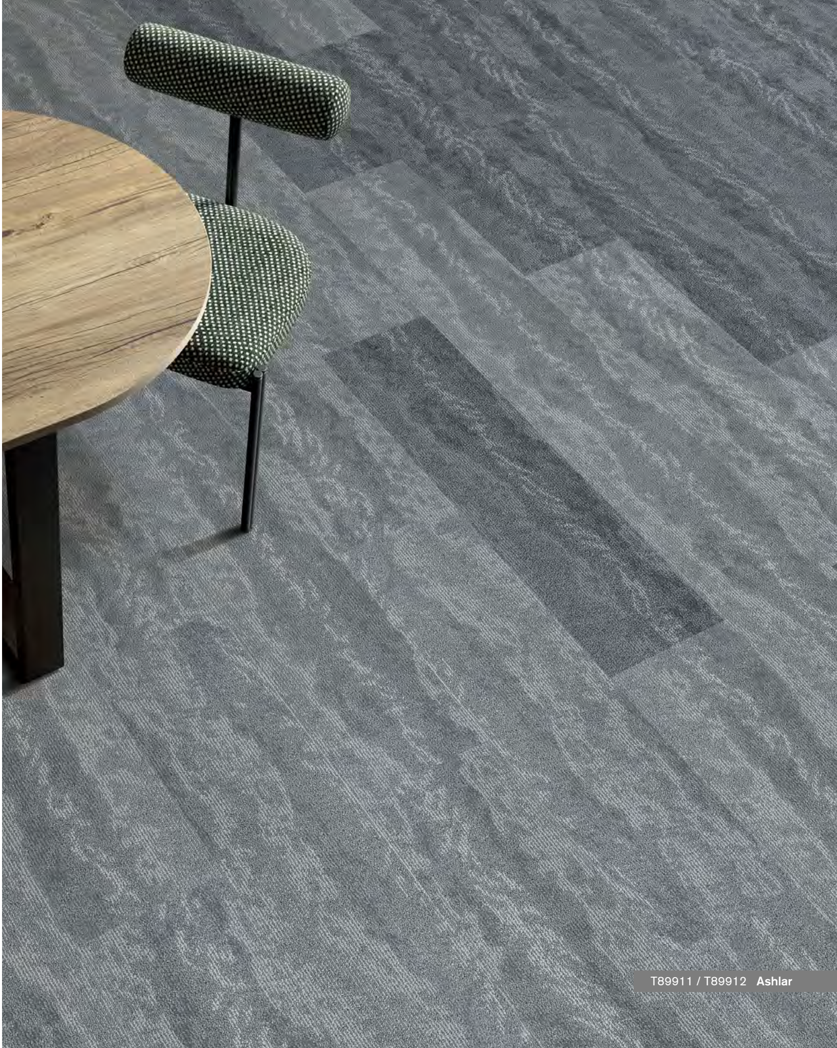
T89911 / T89912 Ashlar