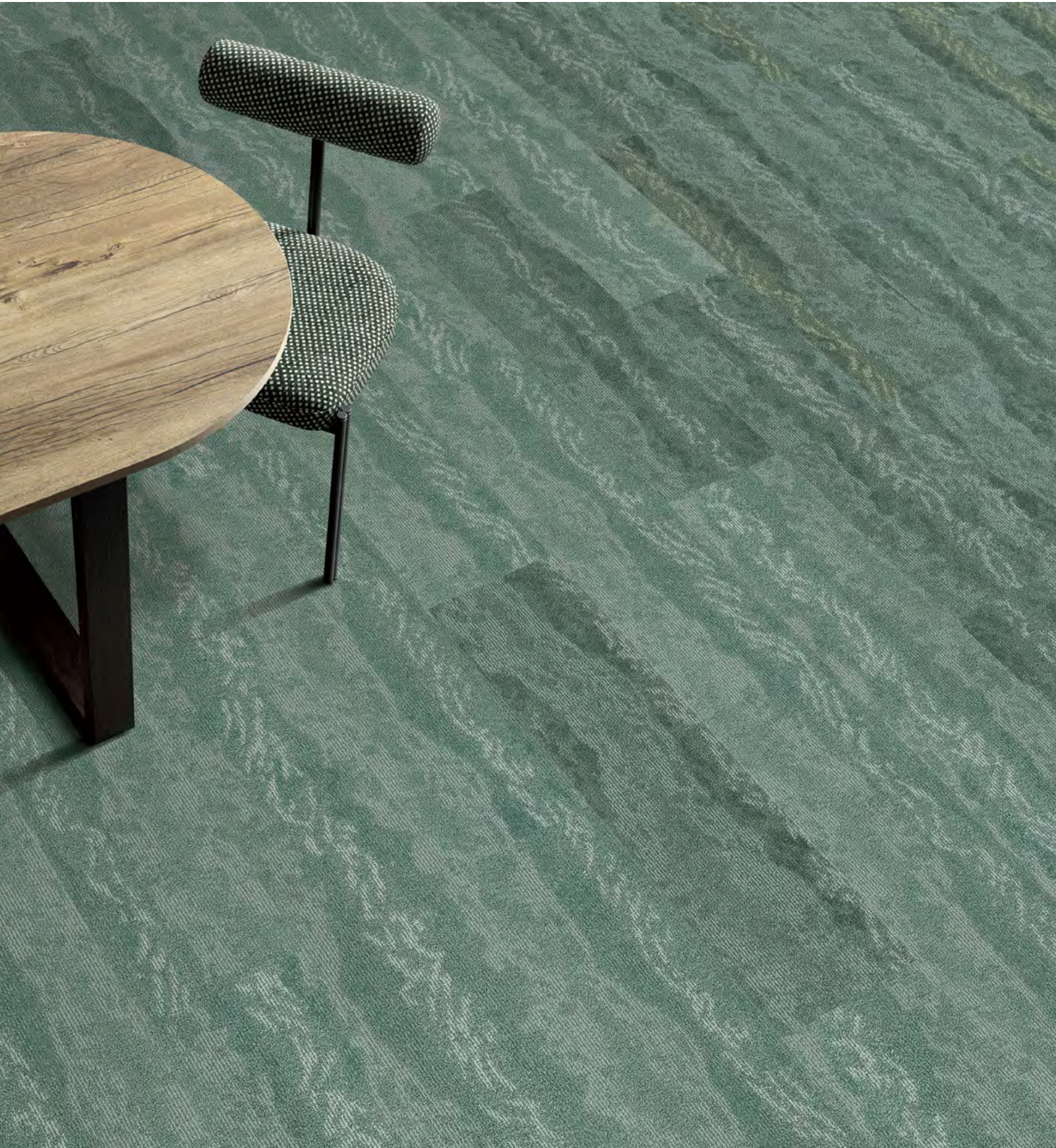
T89908 / T89909 / T89910 Ashlar