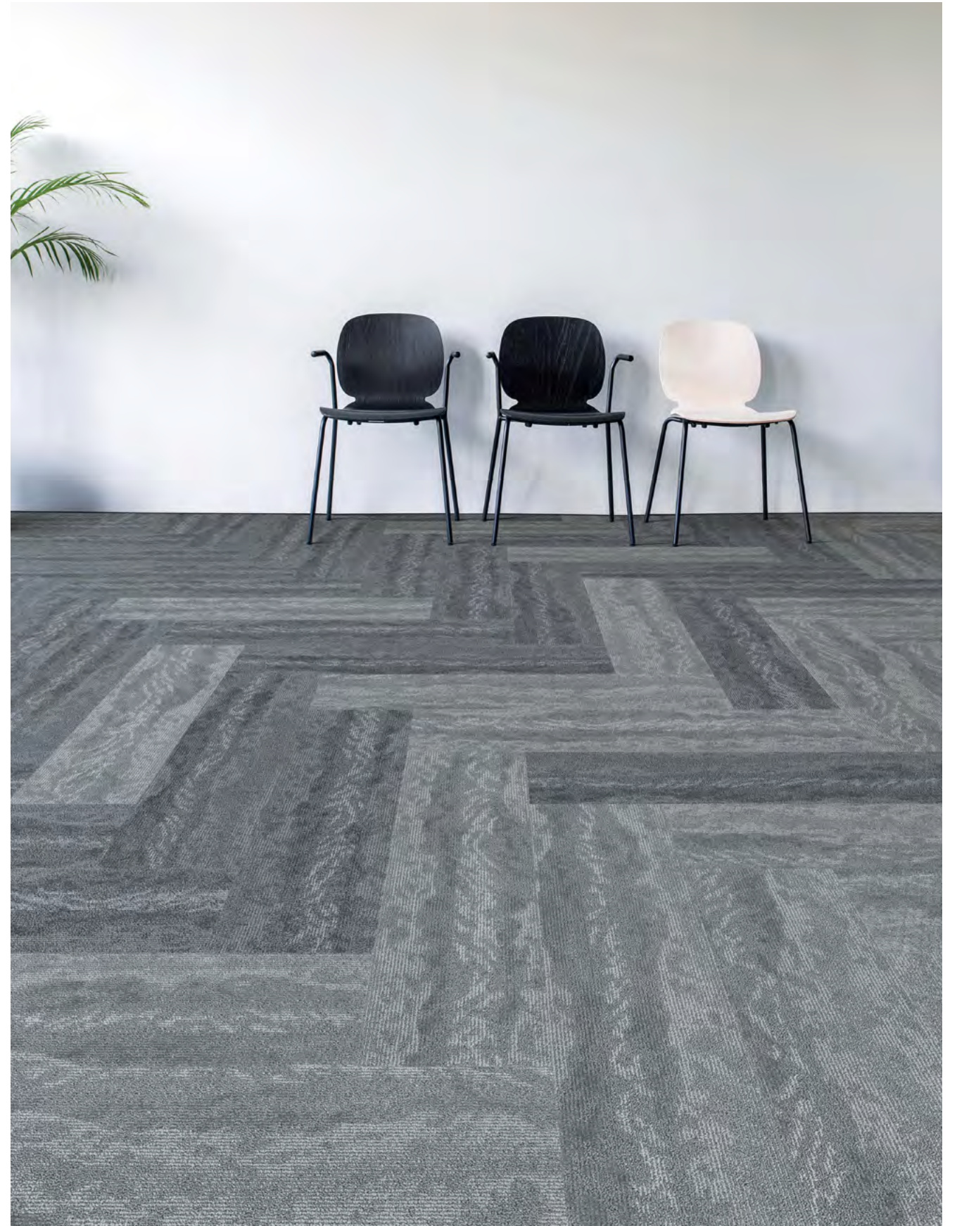
T89911 / T89912 Herringbone