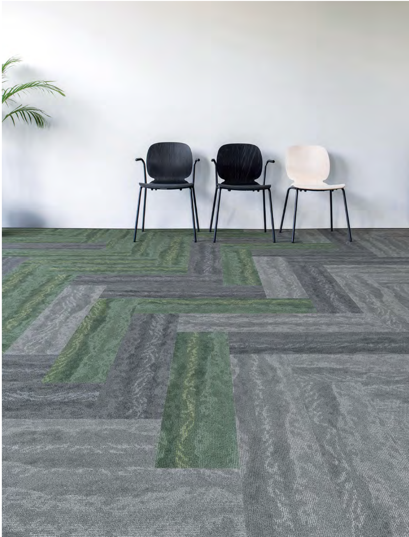
T89910 / T89911 / T89912 Herringbone