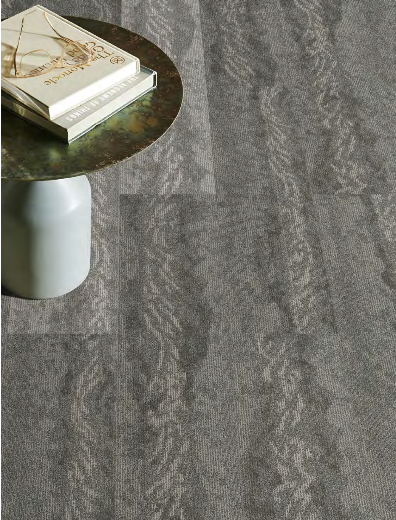
T89901 / T89902 Ashlar