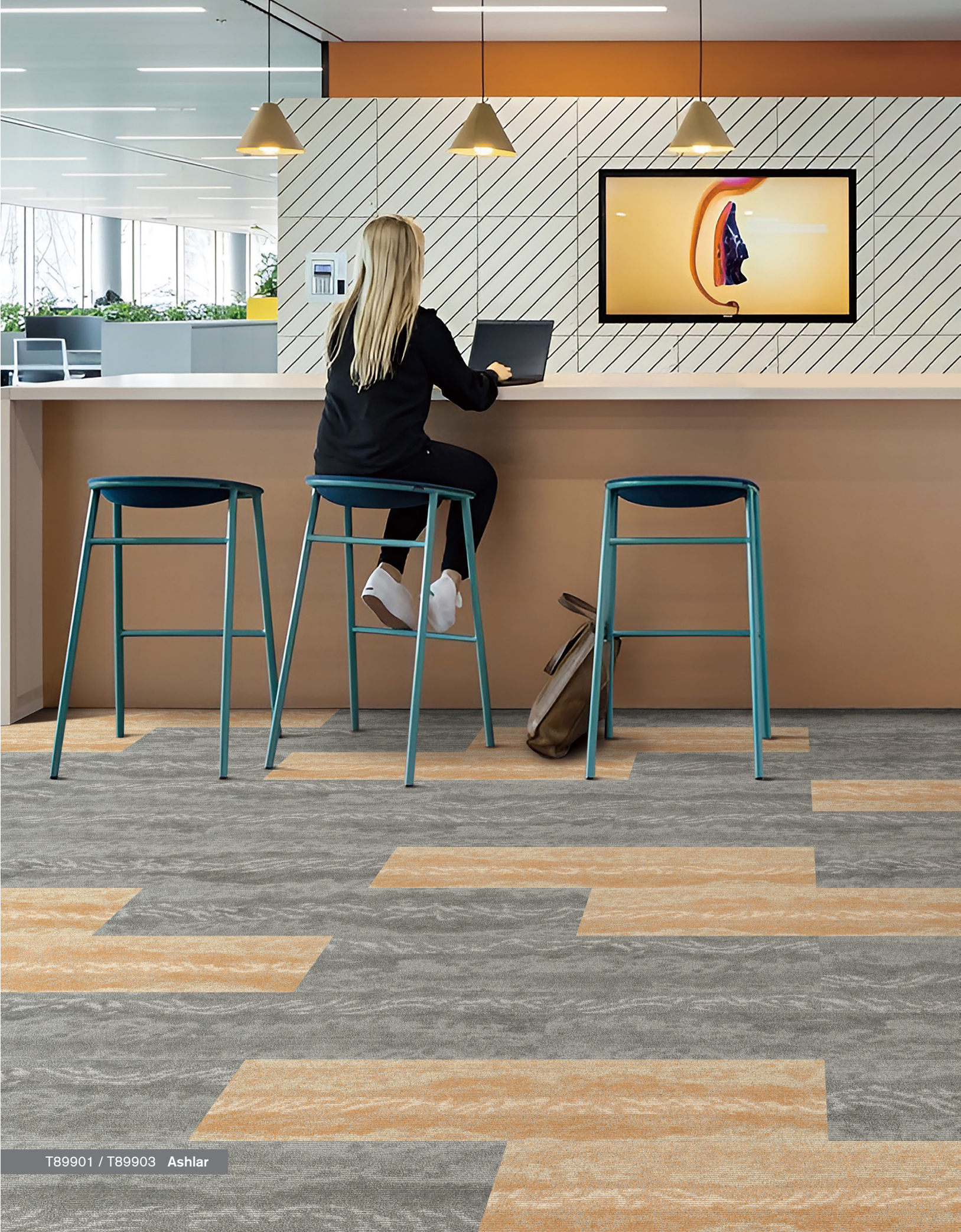
T89901 / T89903 Ashlar