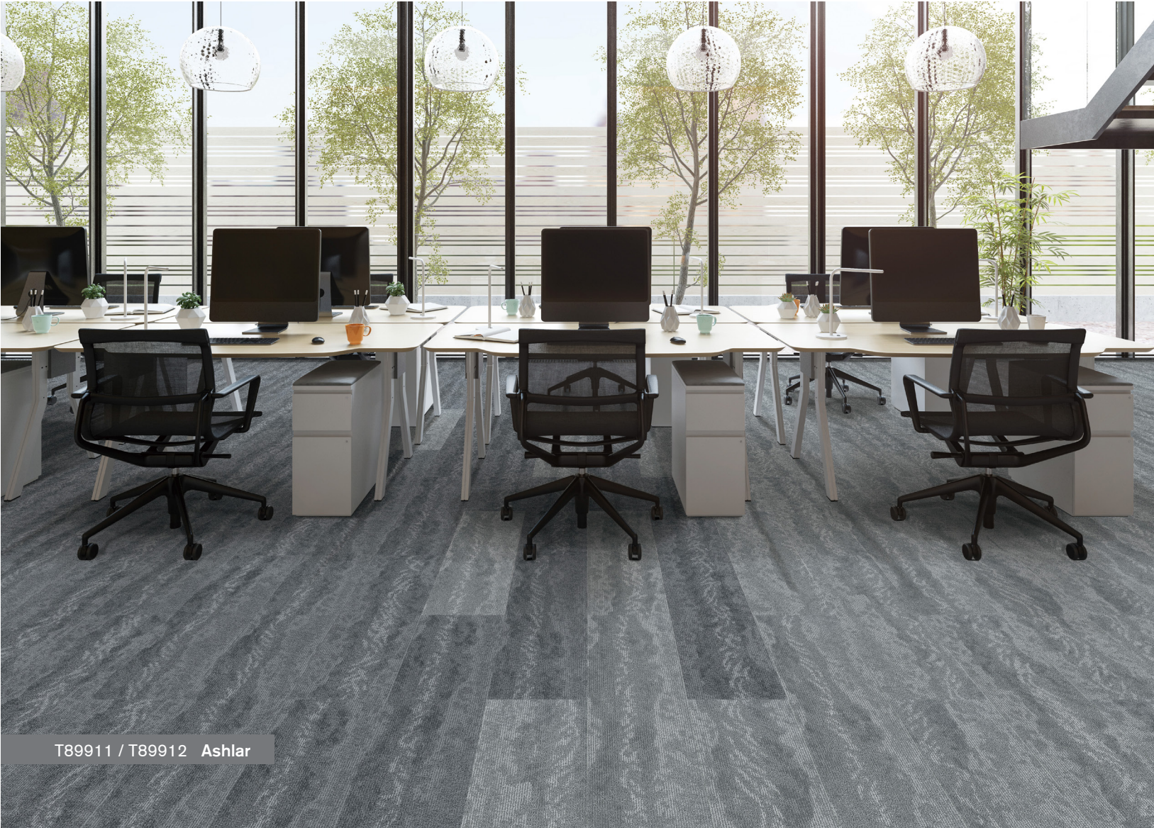
T89911 / T89912 Ashlar