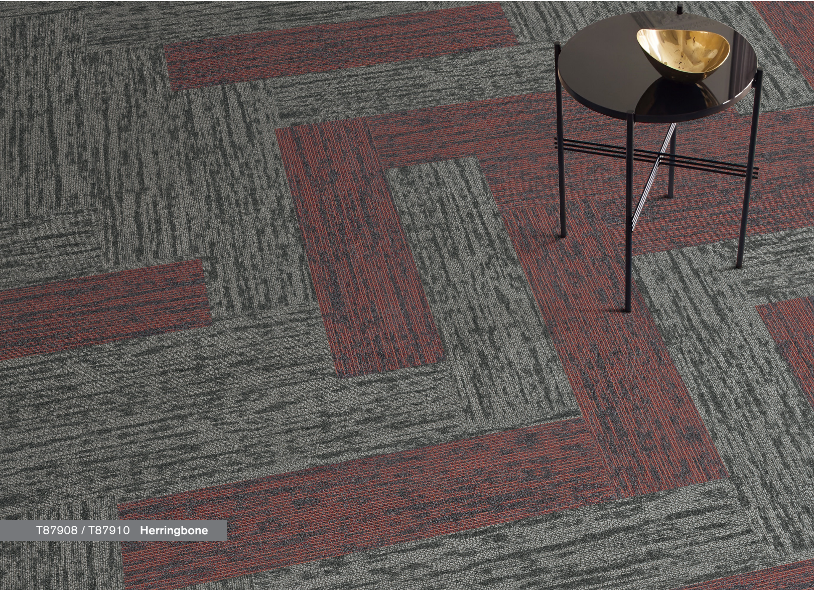
T87908 / T87910 Herringbone