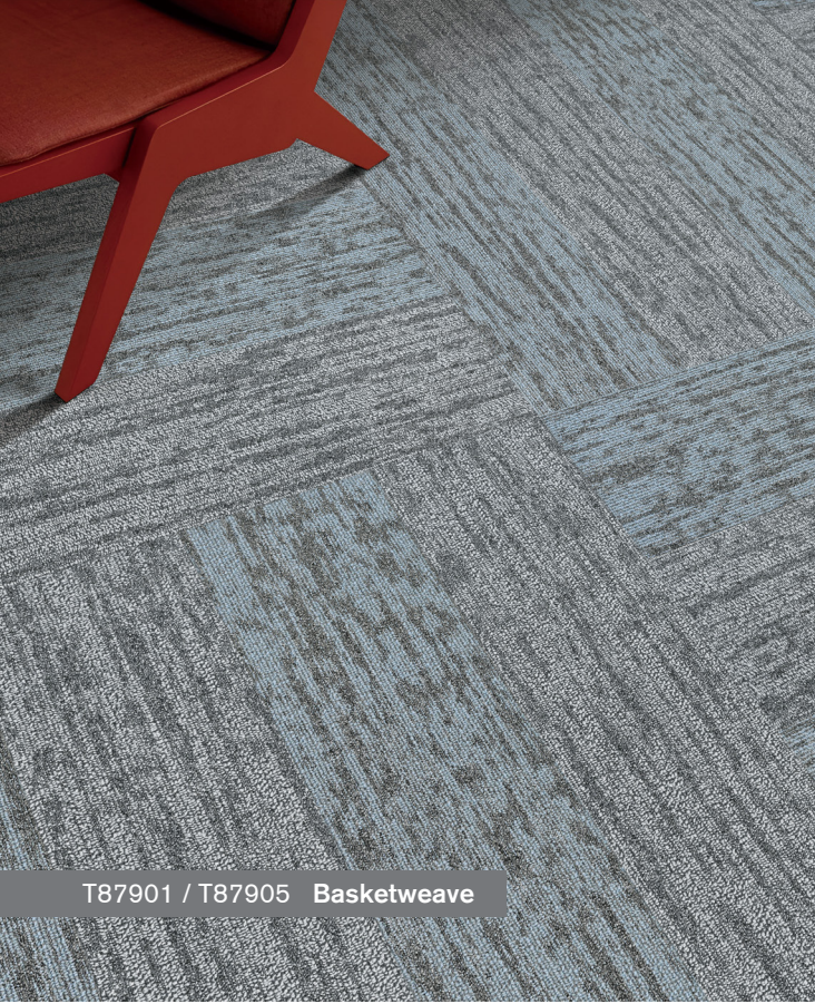
T87901 / T87905 Basketweave

T879 Imprints captures the subtle beauty of a rain-kissed path, transforming it into a sophisticated design for commercial spaces. Its palette features warm beige and light gray as sun-drenched ground, while deep brown and charcoal "wheel tracks" meander across the surface in organic, varied lines.