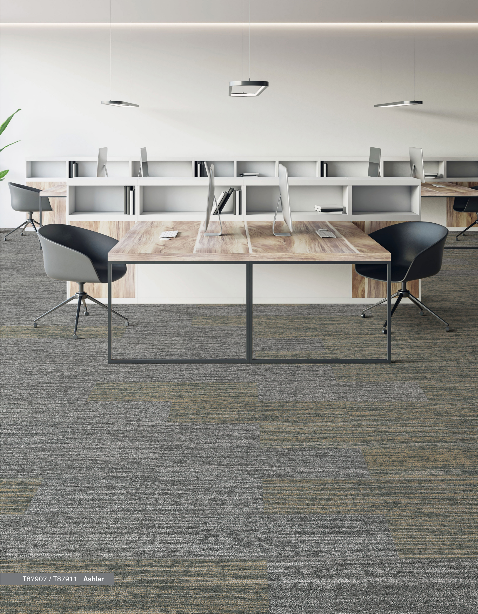
T87907 / T87911 Ashlar