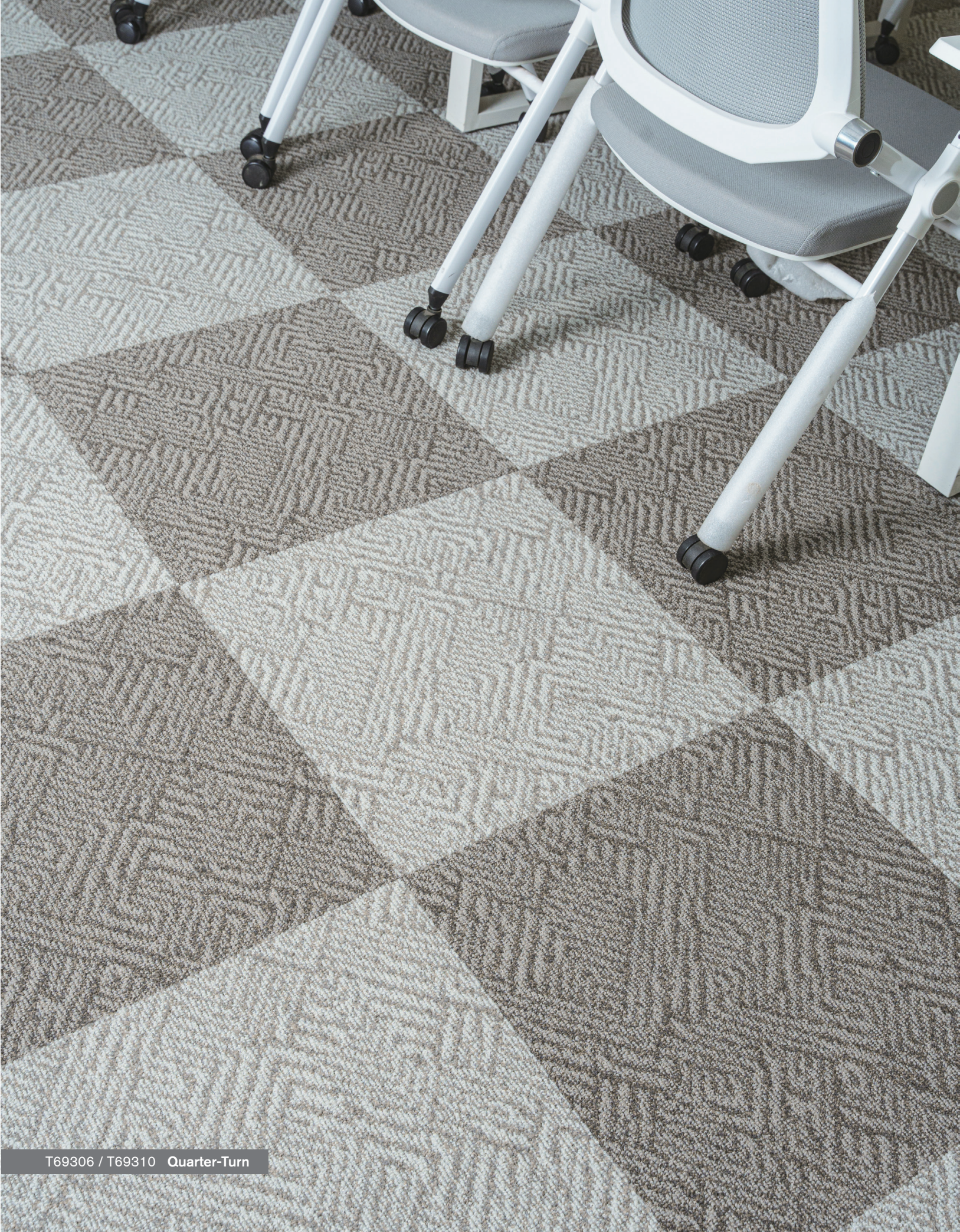
T69306 / T69310 Quarter-Turn