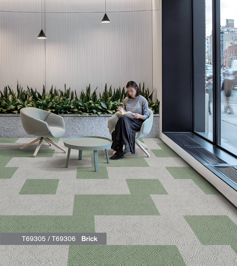
T69305 / T69306 Brick

T693 Dune and T852 Ripple combine and create a balanced and dynamic spatial atmosphere with their unique organic undulations and layered triangular patterns.