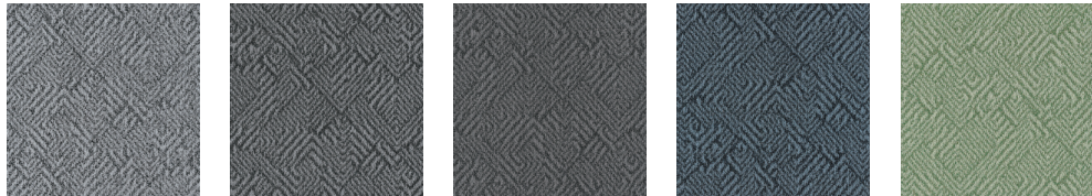
T69301 Coin T69302 Anchor T69303 Pebble T69304 Aegean T69305 Sage