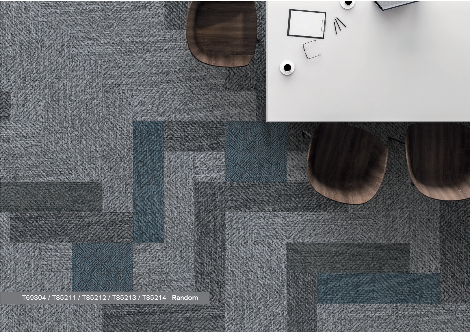
T69304 / T85211 / T85212 / T85213 / T85214 Random