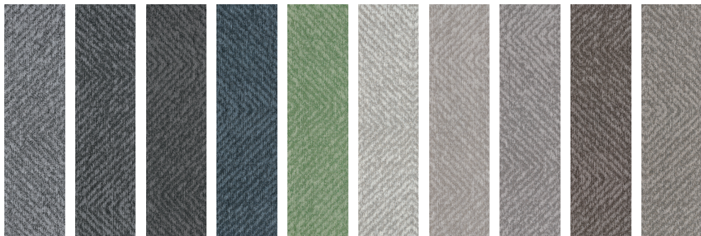
T85211 Coin T85212 Anchor T85213 Pebble T85214 Aegean T85215 Sage T85216 Beige T85217 Sugar Cookie T85218 Brunette T85219 Umber T85220 Oat