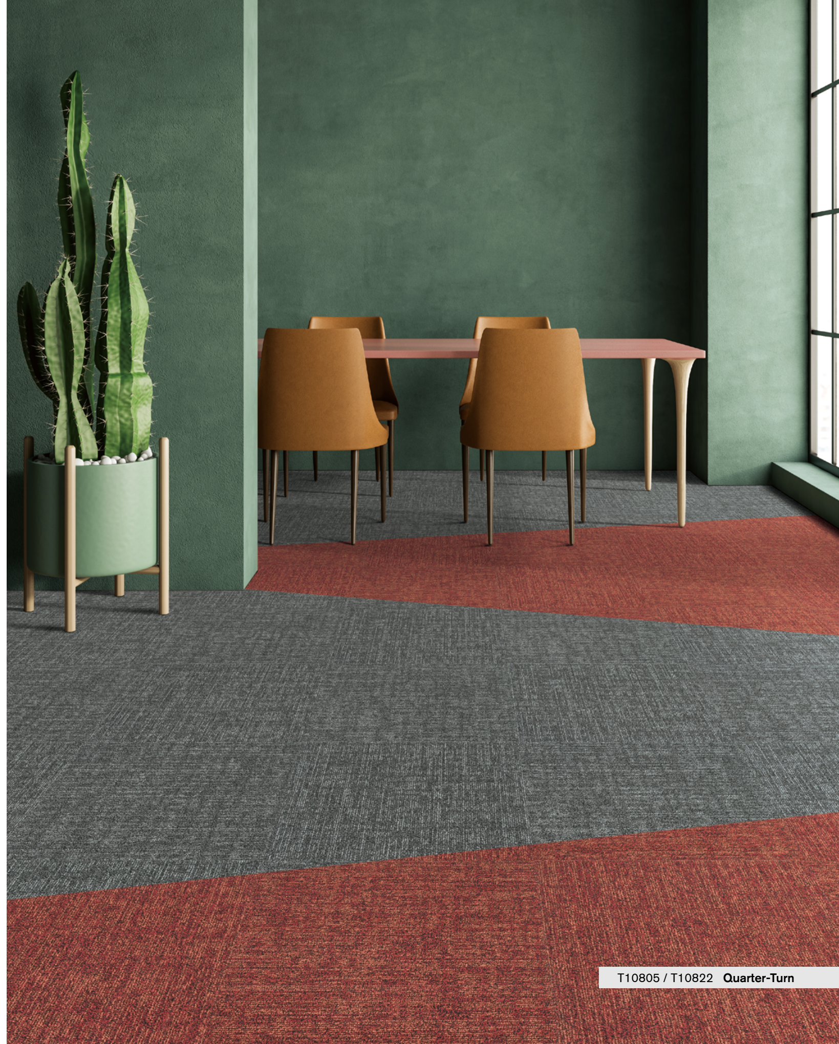
T10805 / T10822 Quarter-Turn