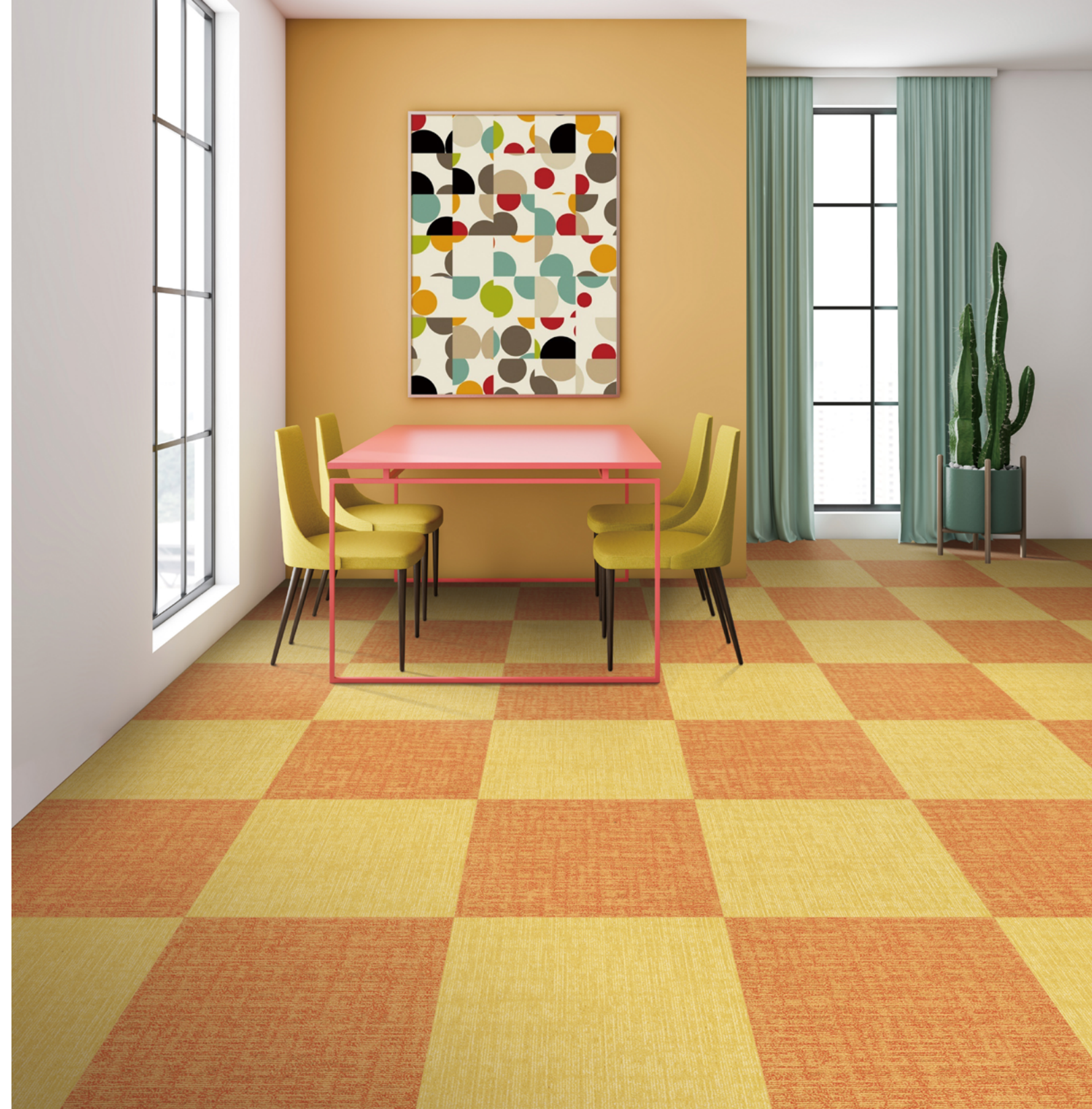
T10829 / T10838 Quarter-Turn