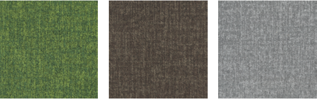
T10821 Emerald T10835 Iron T10825 Silver