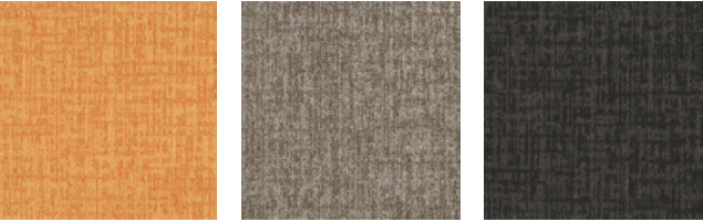
T10829 Orange T10834 Hazel Wood T10806 Charcoal