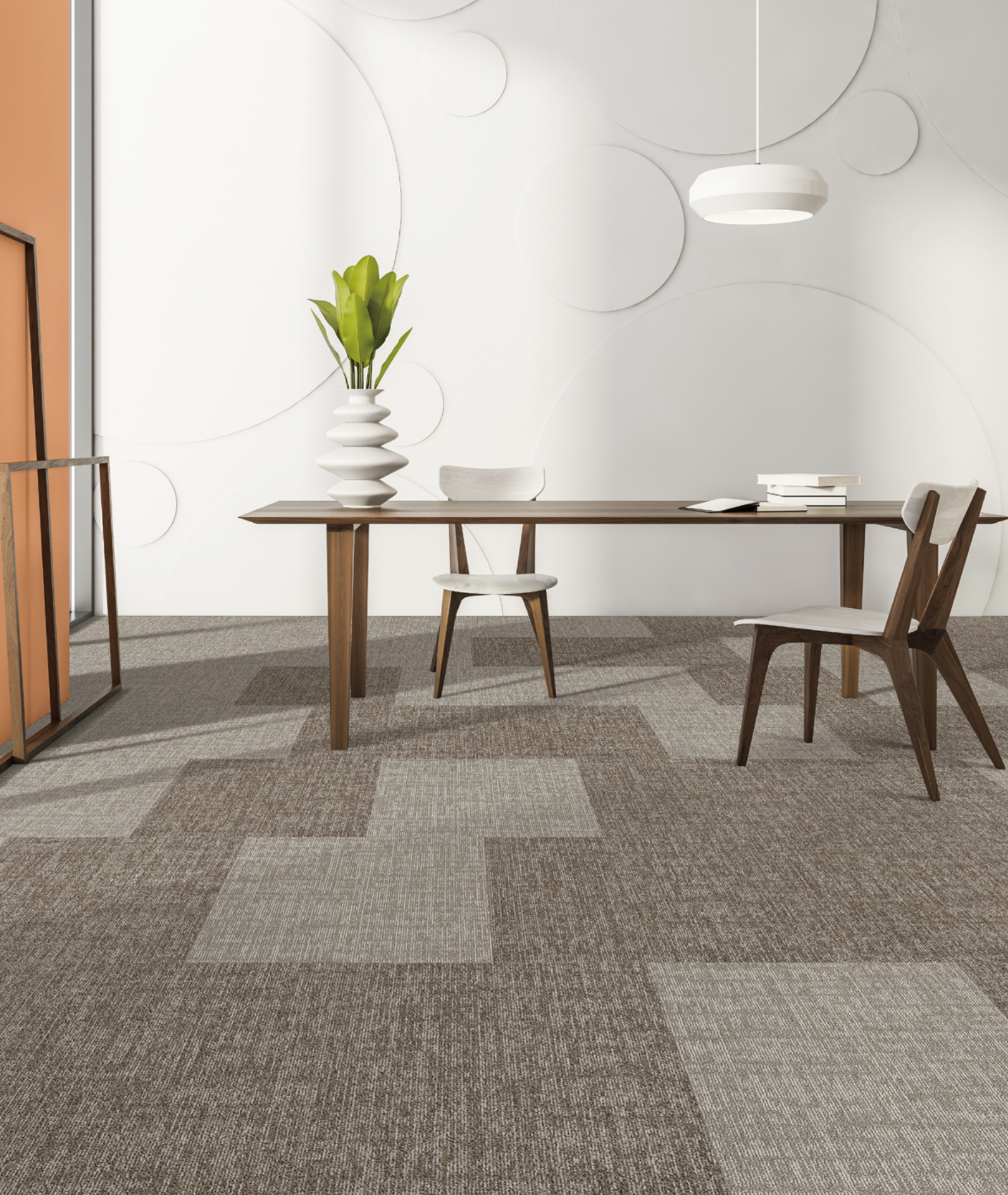
T10826 / T10834 Brick