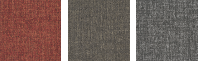
T10822 Ruby T10817 Tawny T10803 Ash