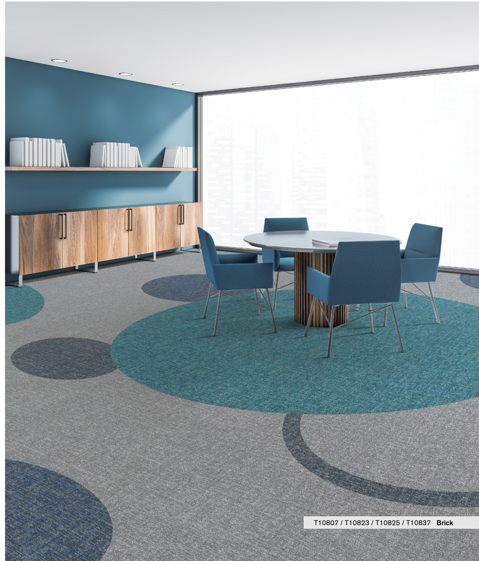
T10807 / T10823 / T10825 / T10837 Brick