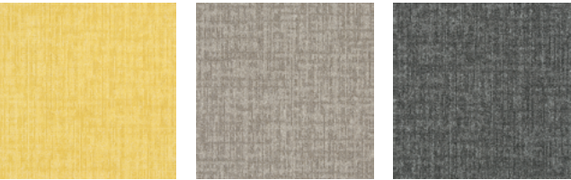
T10838 Yellow T10826 Cloud T10805 Smokey