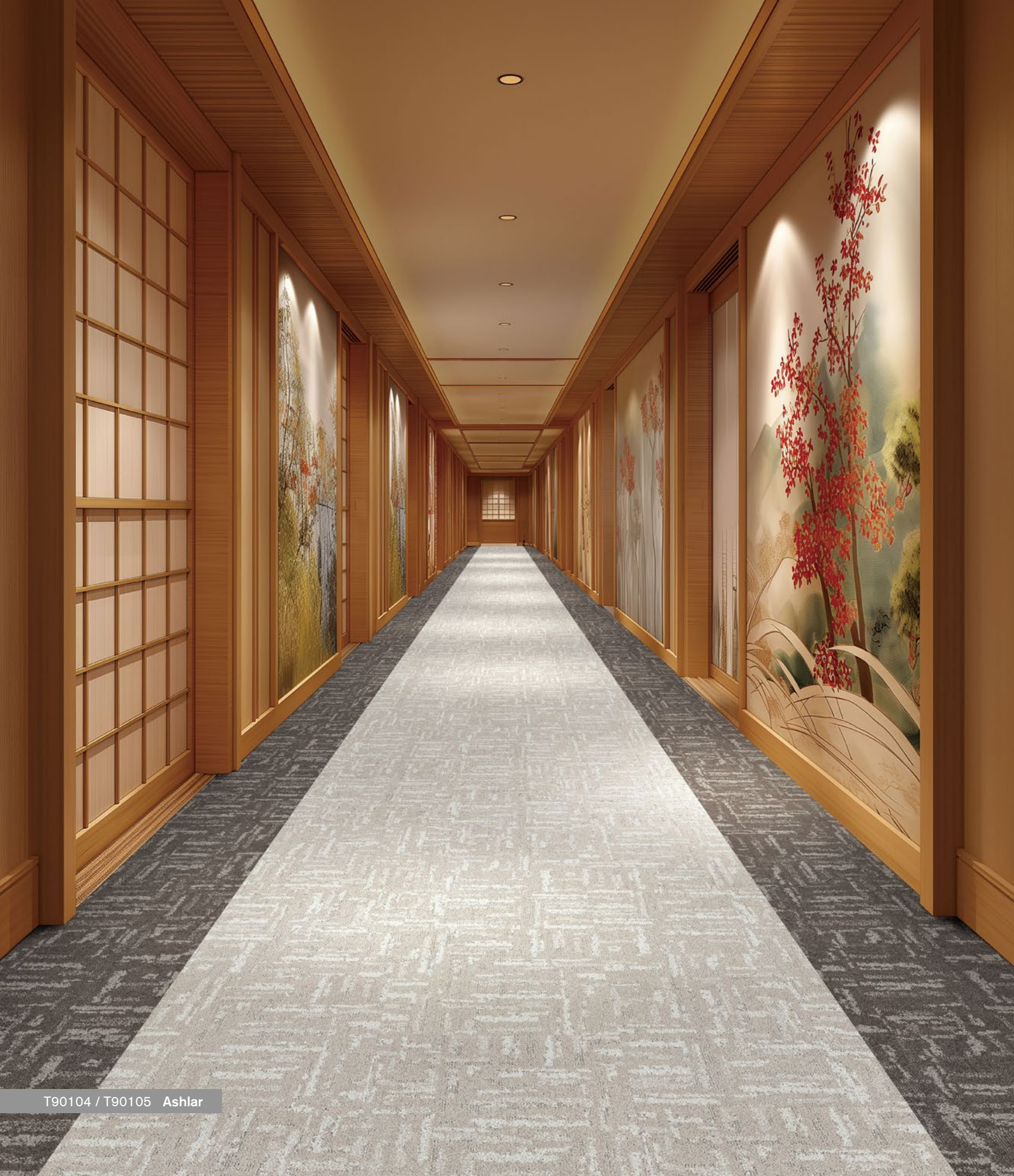
T90104 / T90105 Ashlar