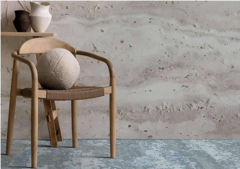
LA1103 / LA1104 Ashlar

Paired with the newly launched LuxCushion™ Air backing, it delivers just the right amount of support while offering a soothing, cushioned experience underfoot.