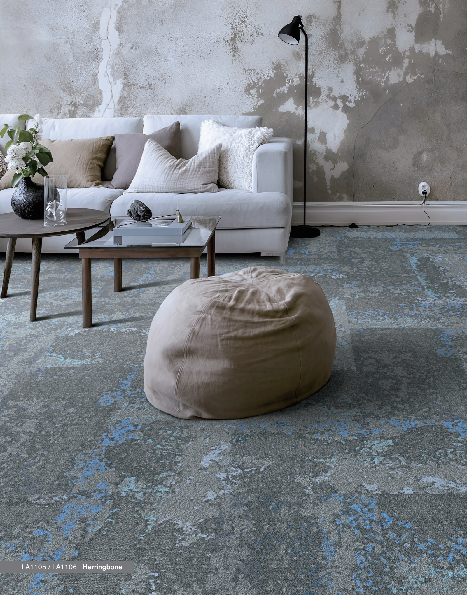
LA1105 / LA1106 Herringbone