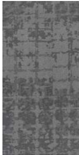
LA0904 Blue Orchid