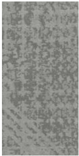
LA0902 Olive Leaf