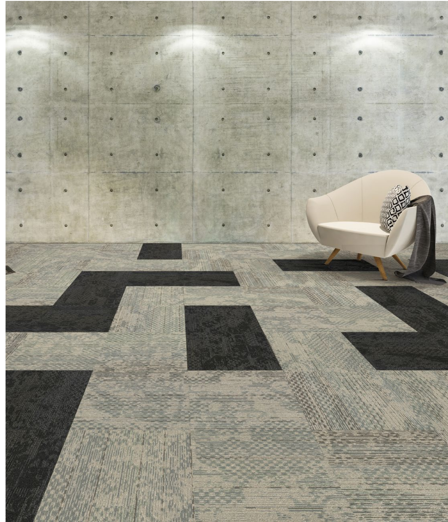
T66204 / T66206 Mix