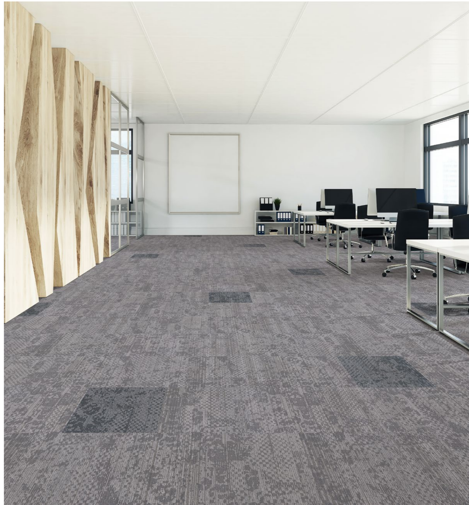
T66202 / T66203 Brick