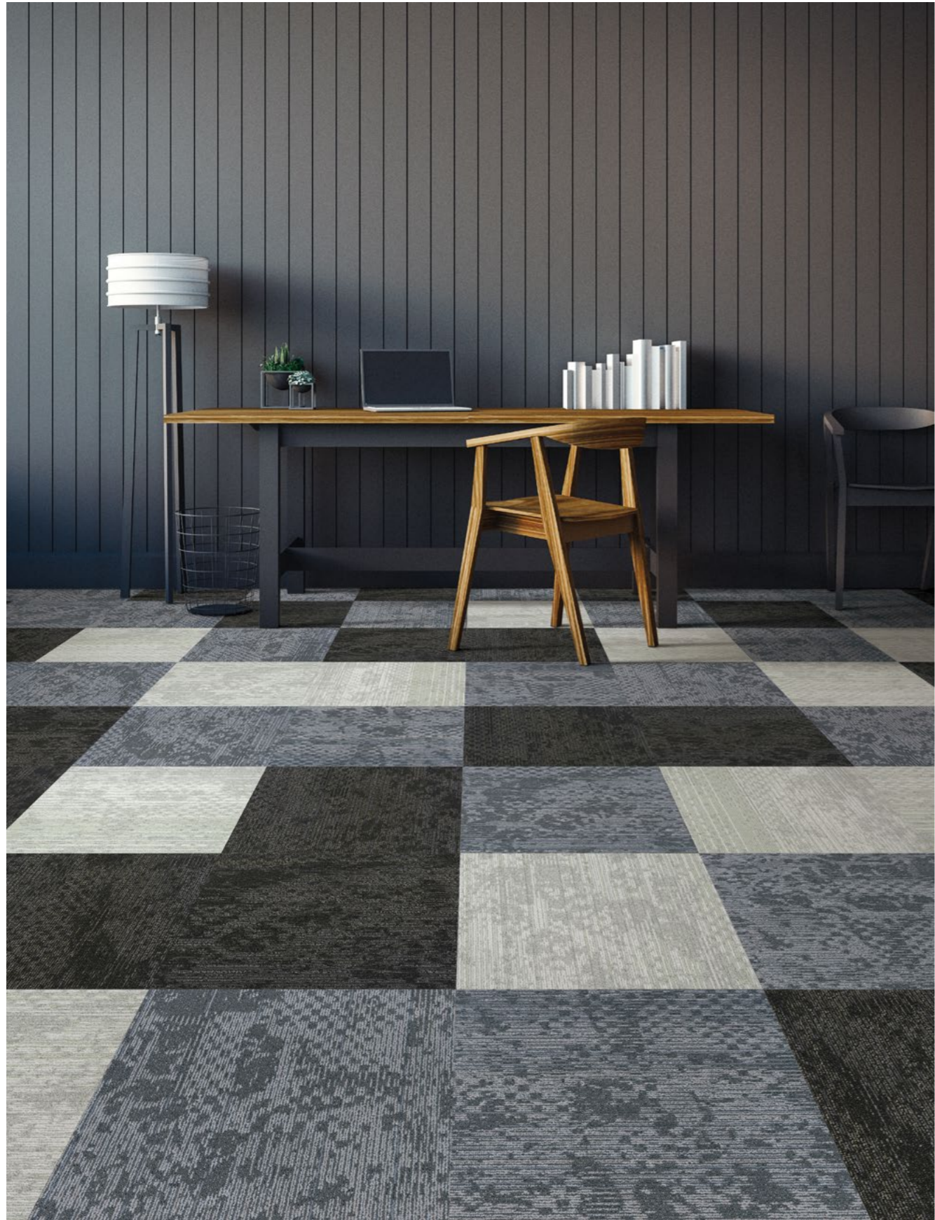
T66202 / T66203 / T66206 Quarter-Turn