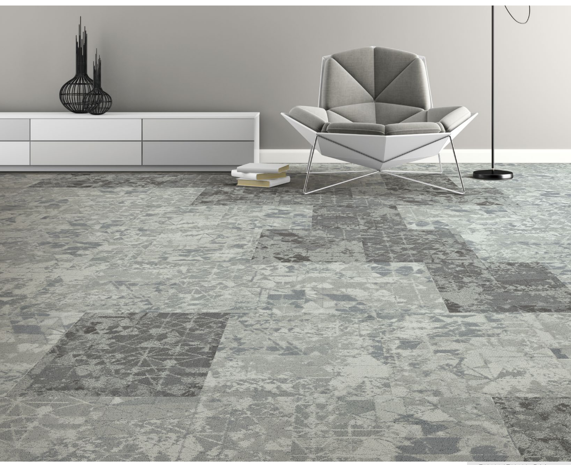
T72101 / T72102 Brick