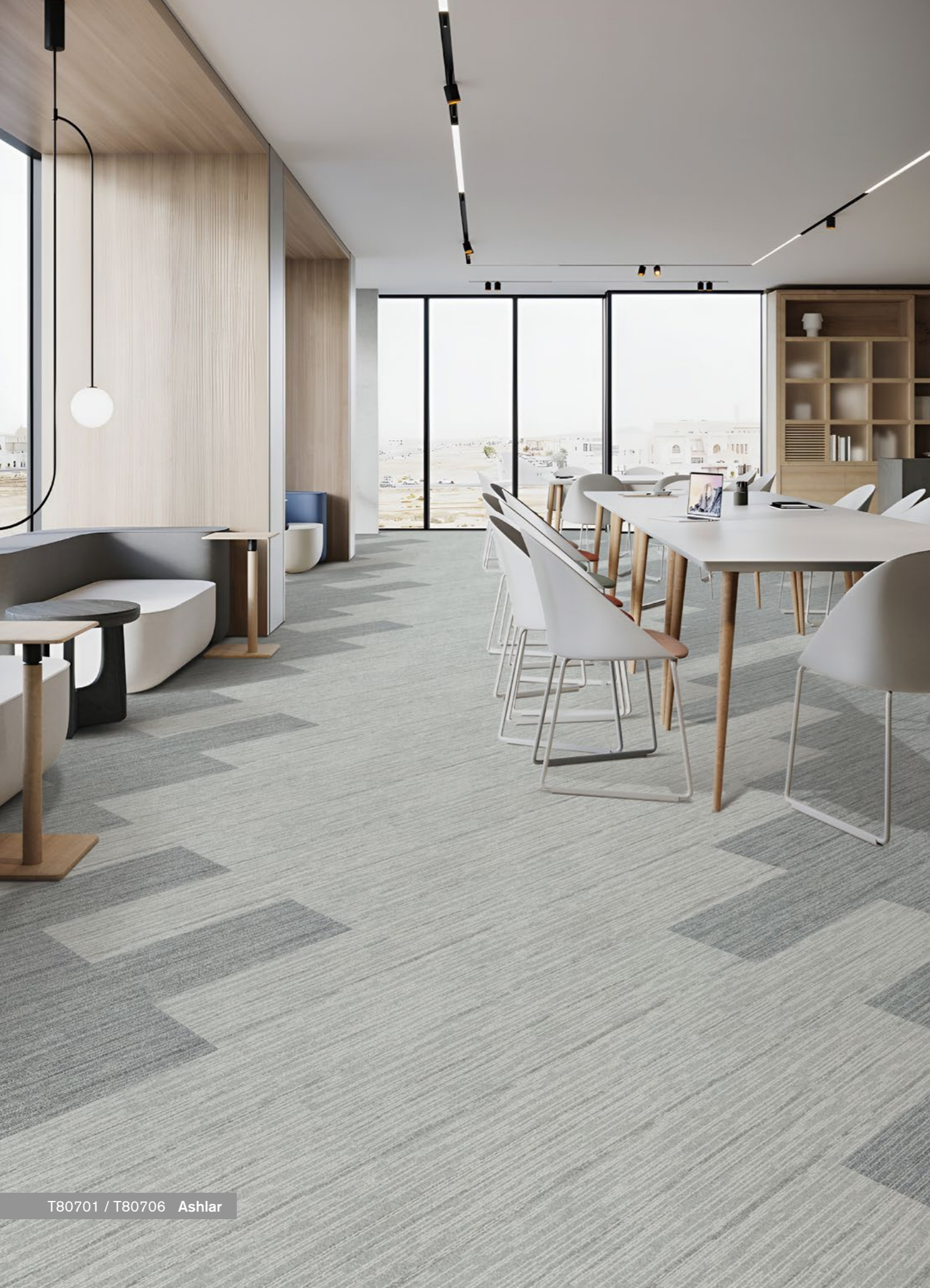
T80701 / T80706 Ashlar