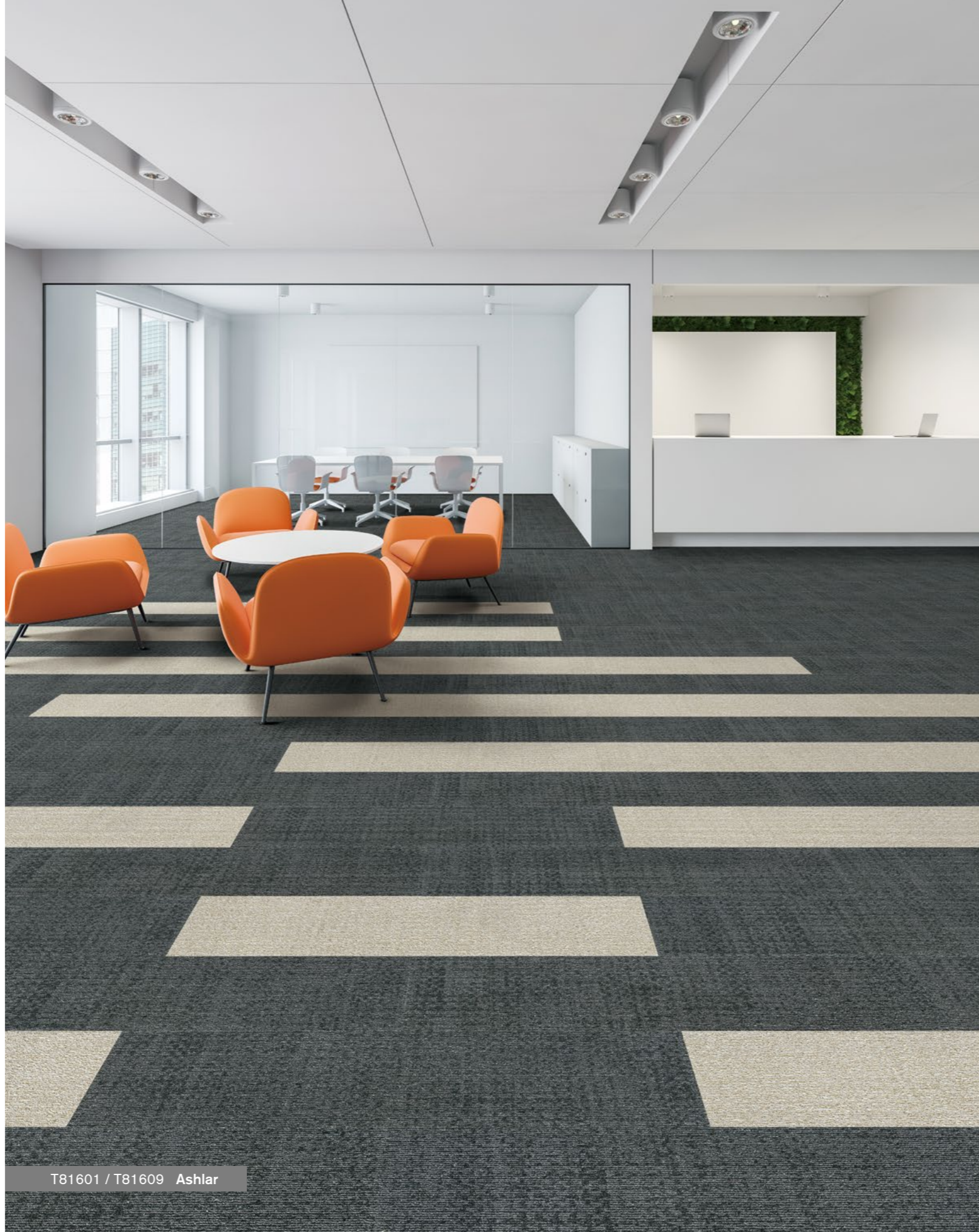
T81601 / T81609 Ashlar