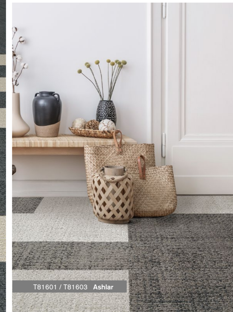
T81601 / T81603 Ashlar