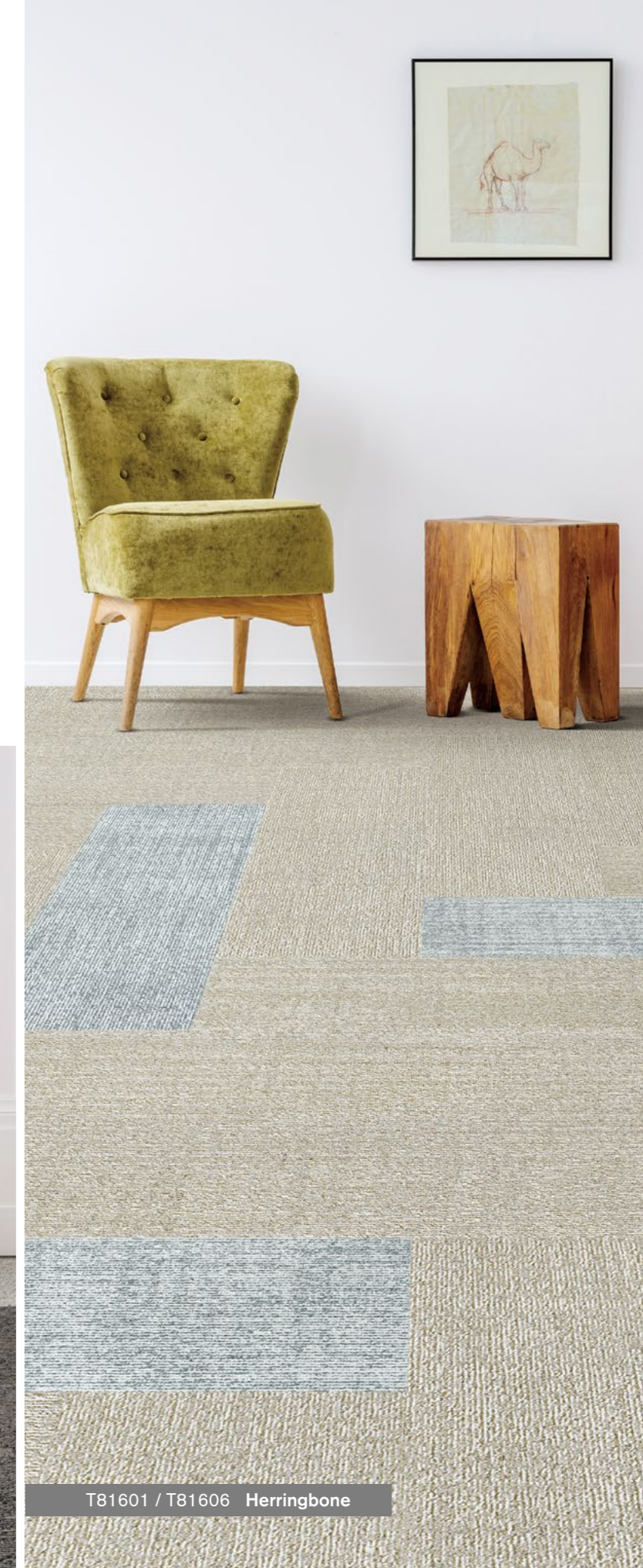
T81601 / T81606 Herringbone