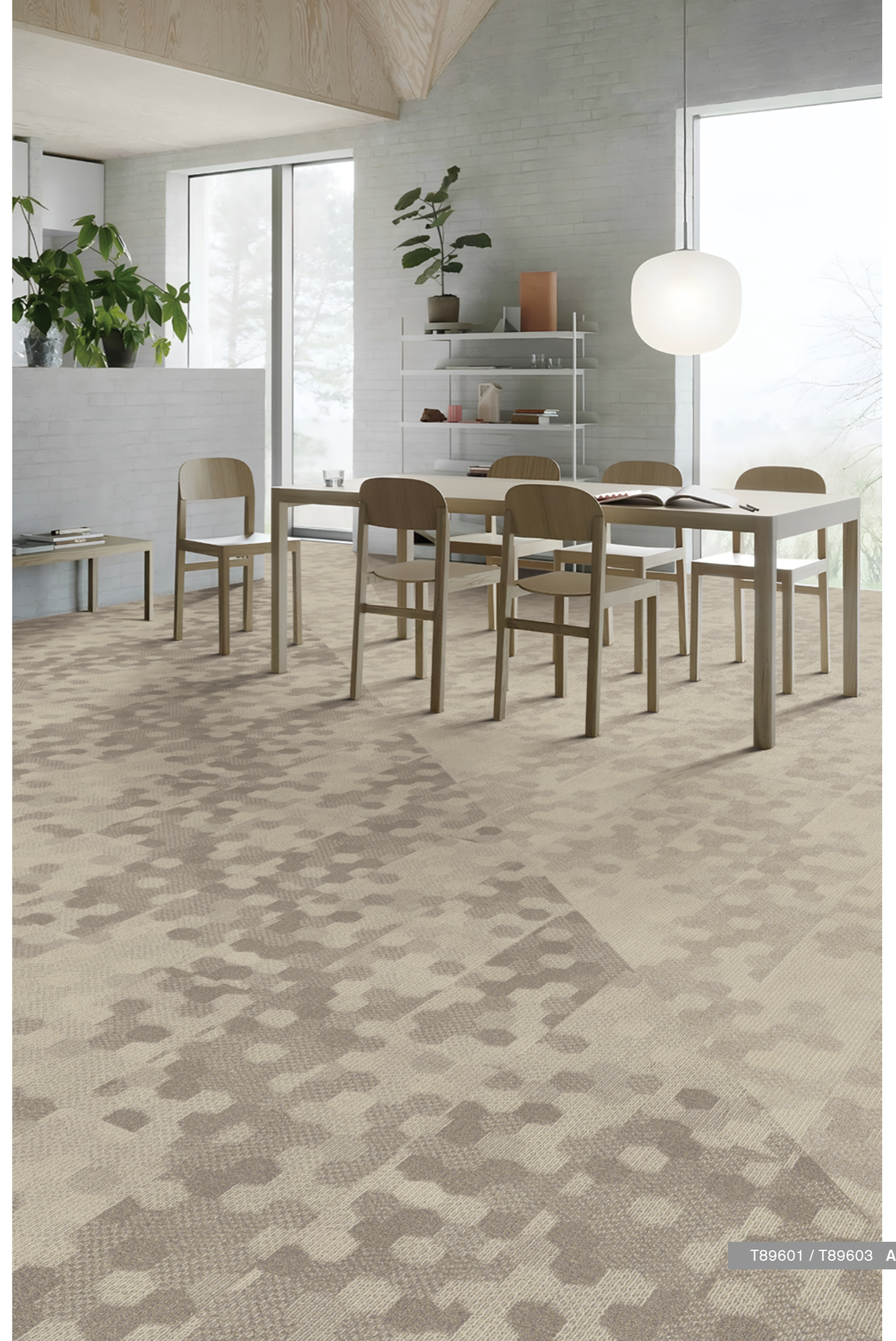
T89601 / T89603 Ashlar