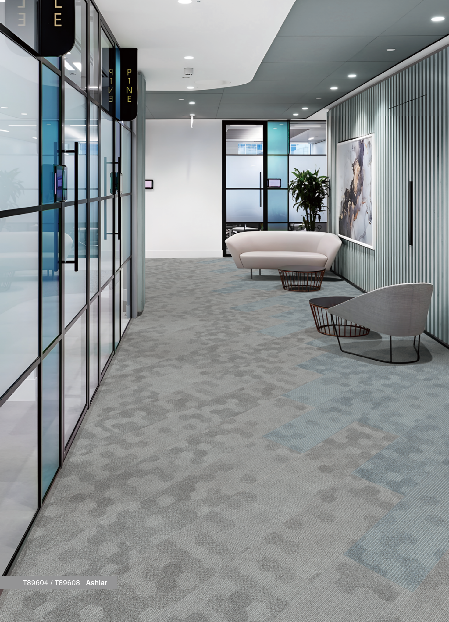
T89604 / T89608 Ashlar