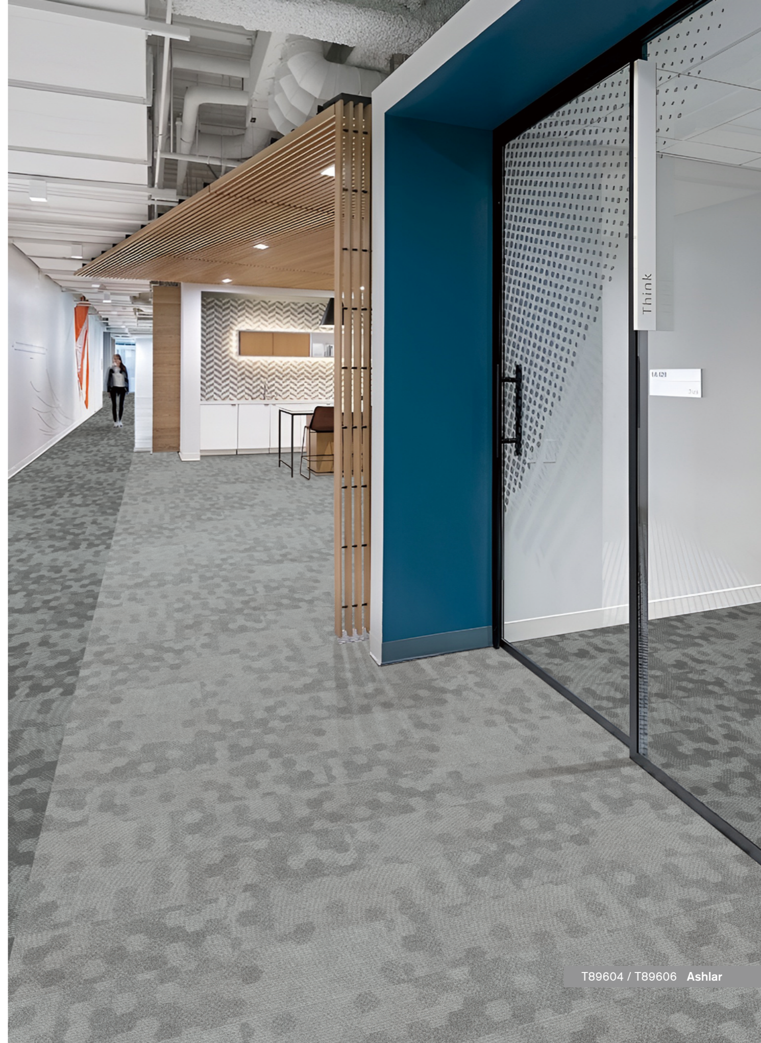
T89604 / T89606 Ashlar