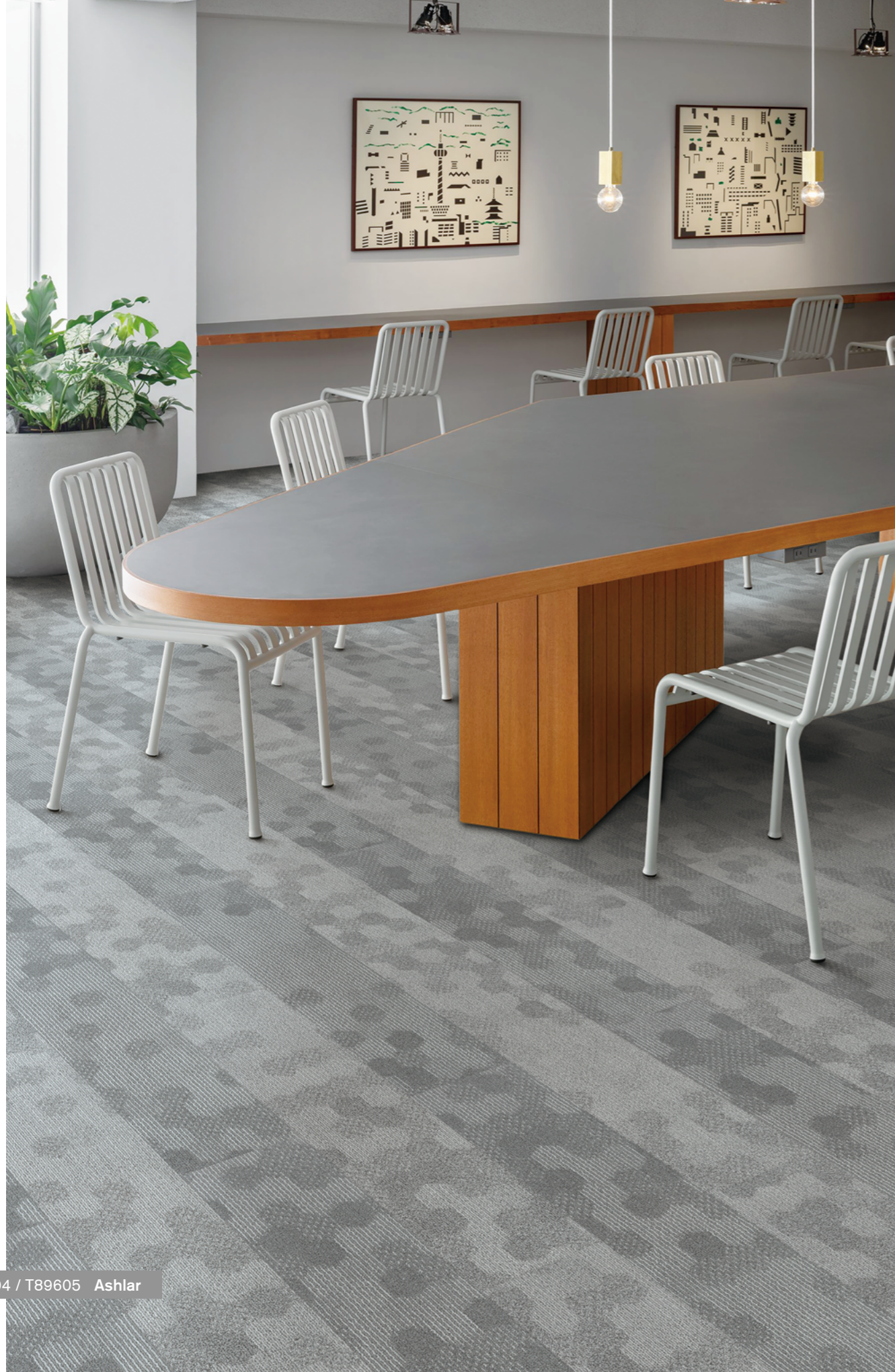
T89604 / T89605 Ashlar