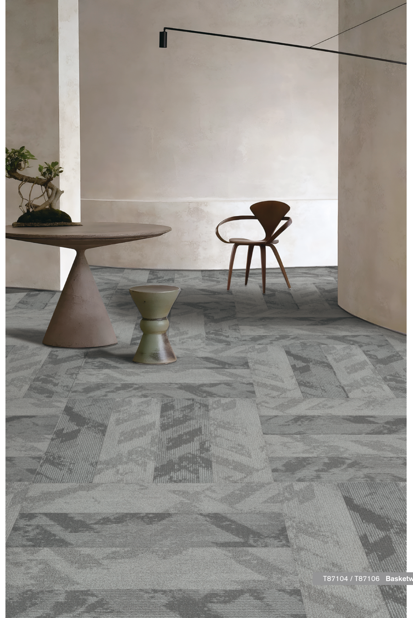
T87104 / T87106 Basketweave