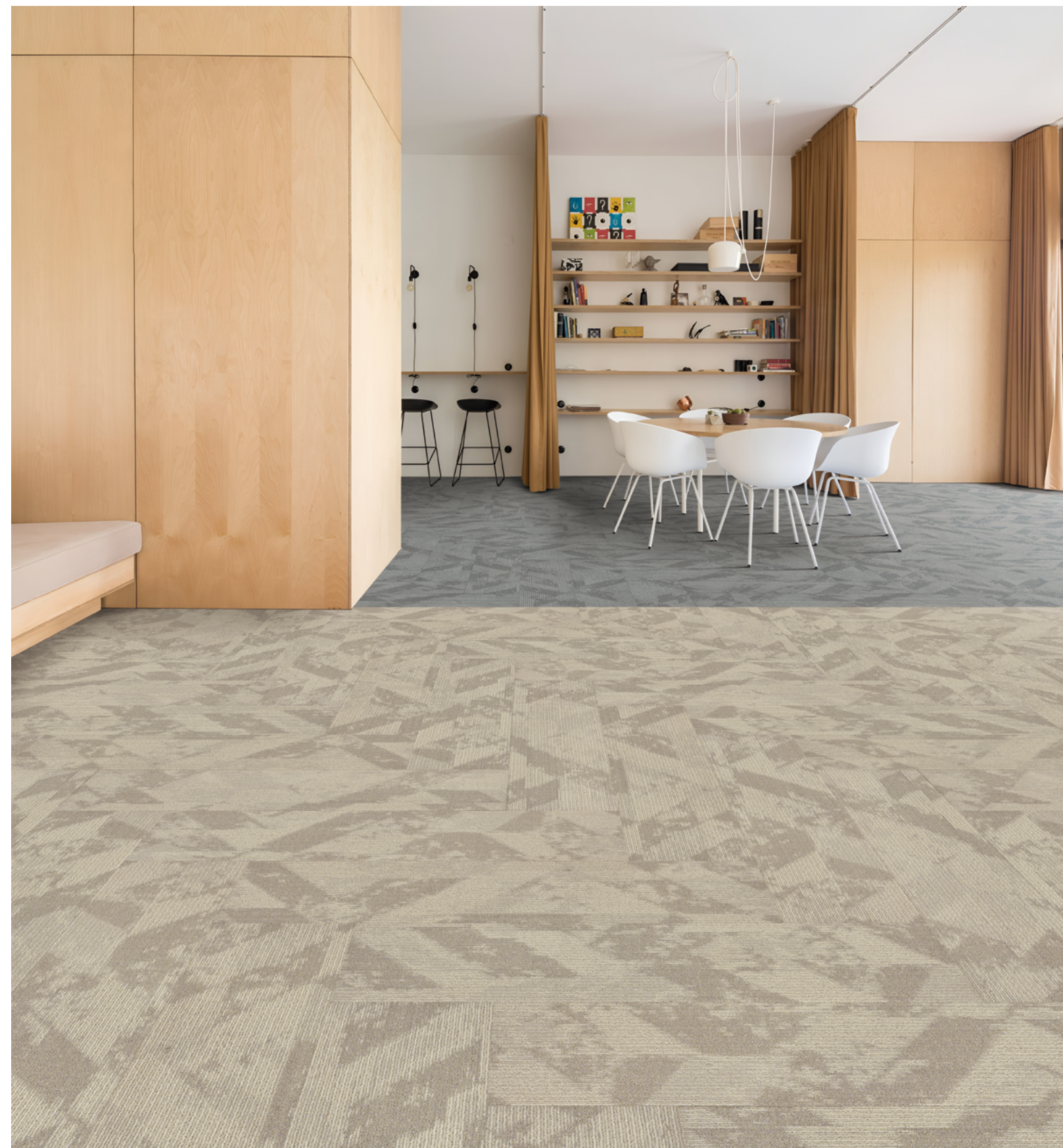
T87102 / T87104 Herringbone