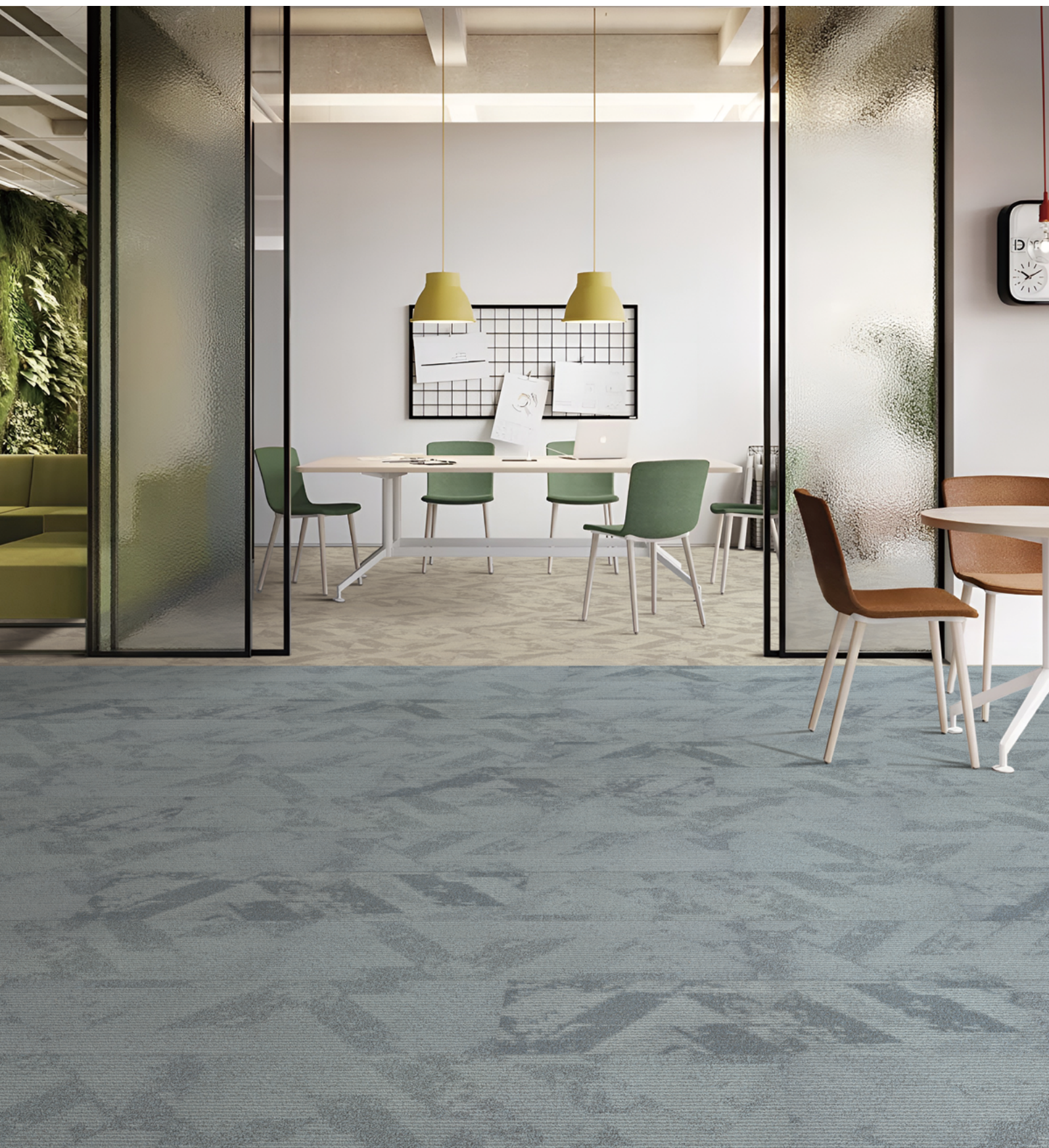
T87102 / T87108 / T87109 Ashlar