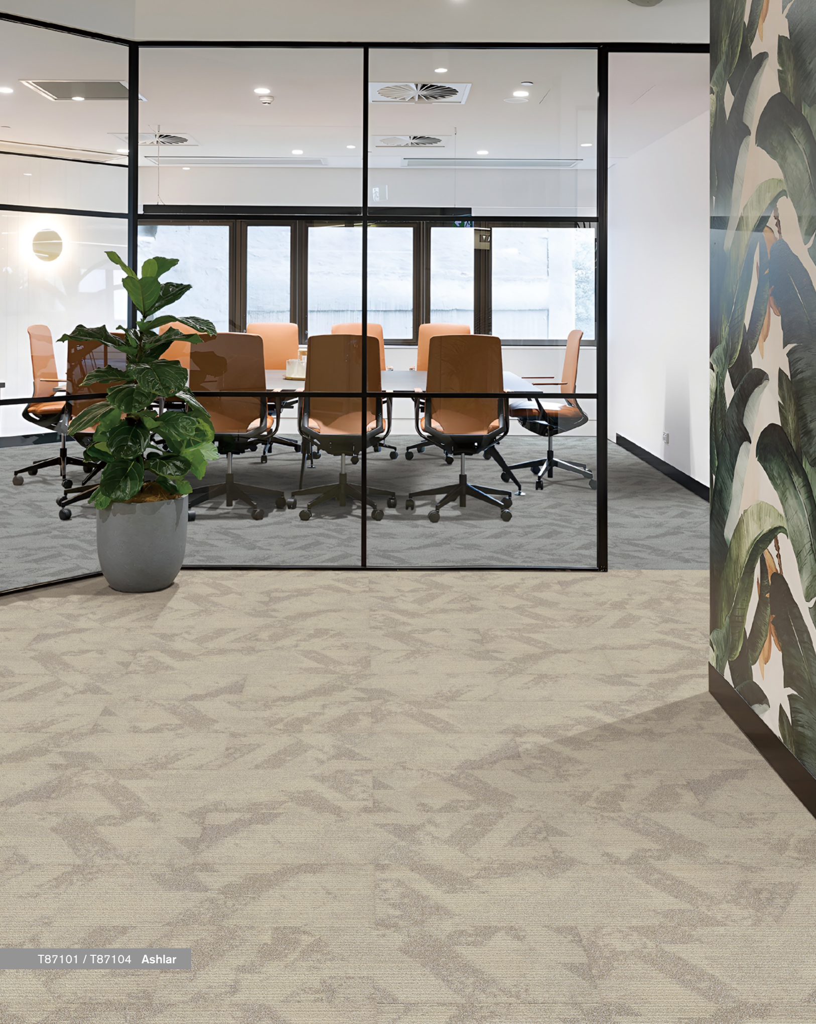
T87101 / T87104 Ashlar