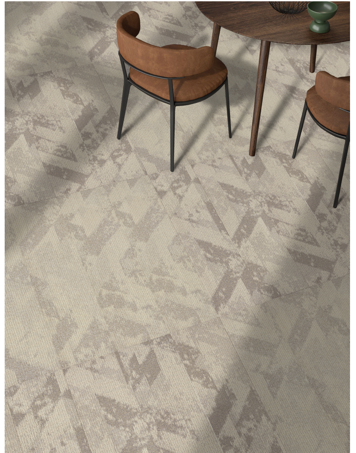
T87101 / T87103 Monolithic