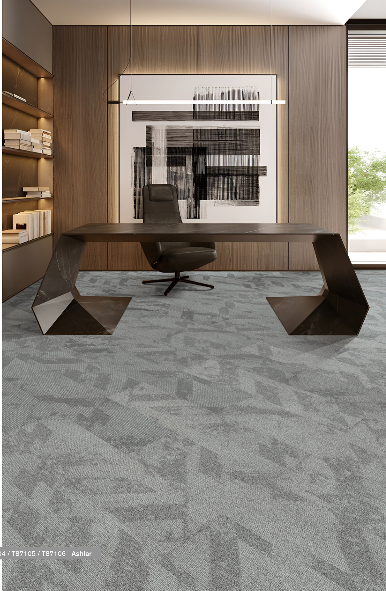
T87104 / T87105 / T87106 Ashlar