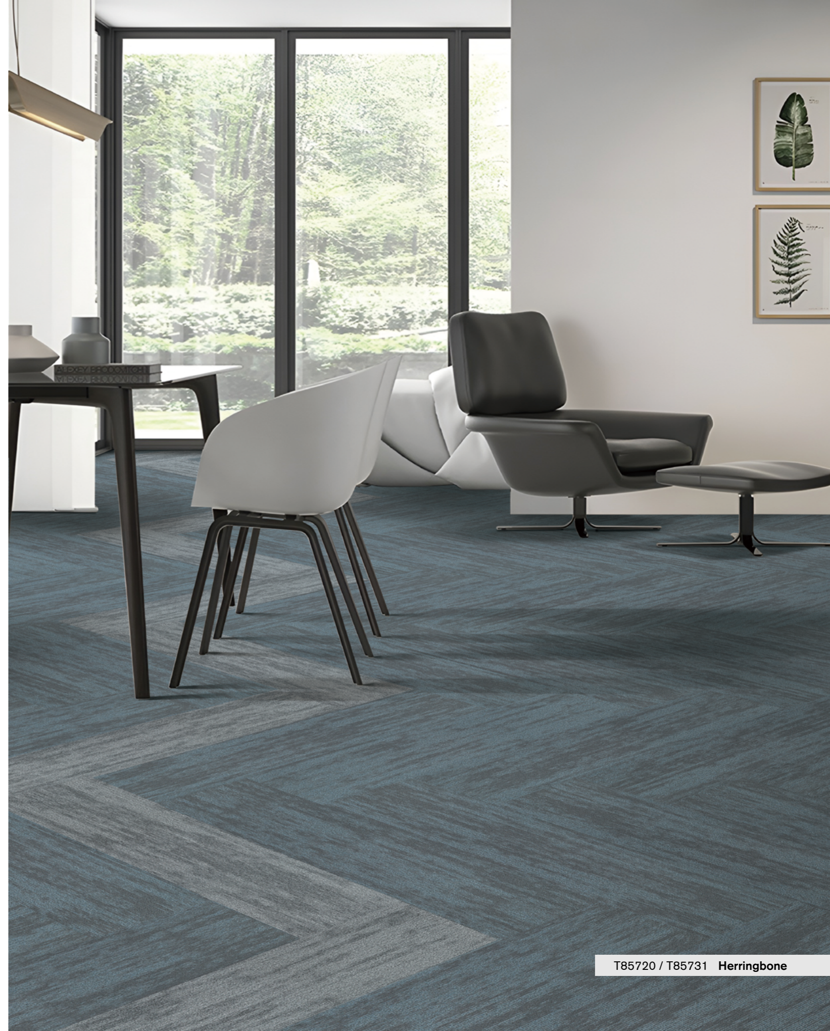
T85720 / T85731 Herringbone