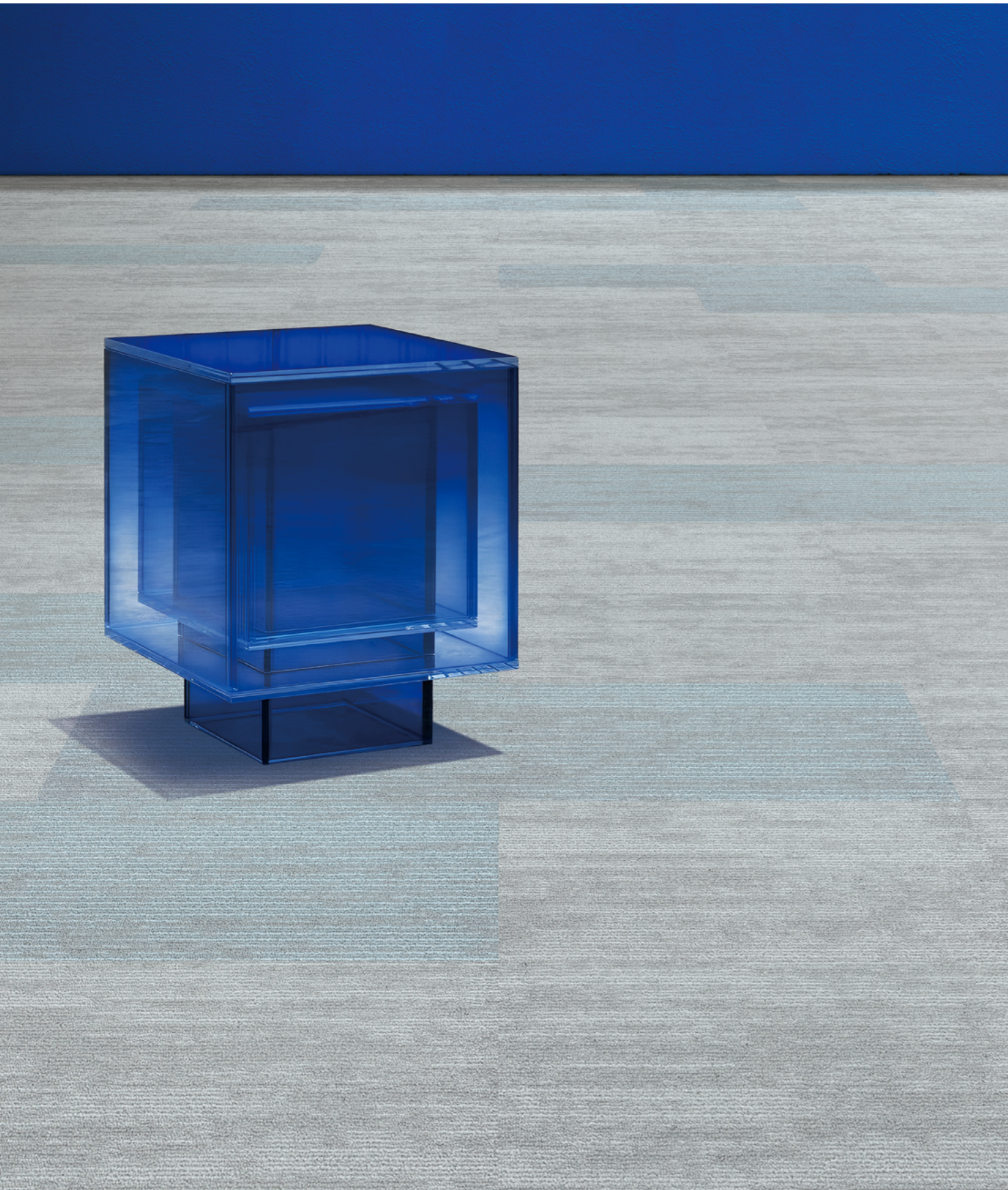
T85710 / T85712 Ashlar