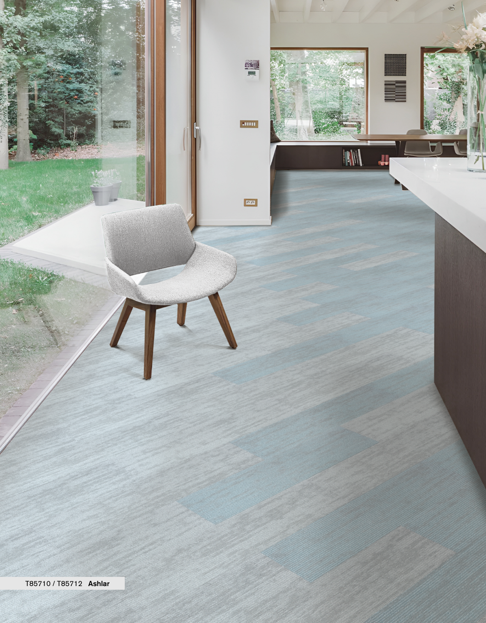
T85710 / T85712 Ashlar