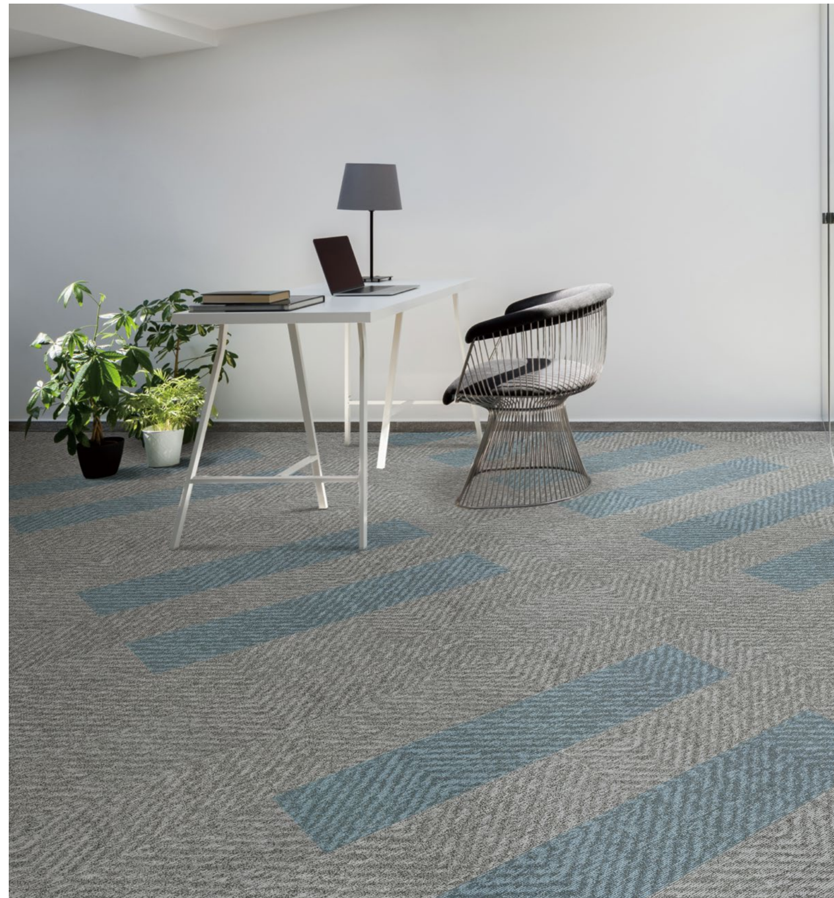
T85202 / T85204 Ashlar