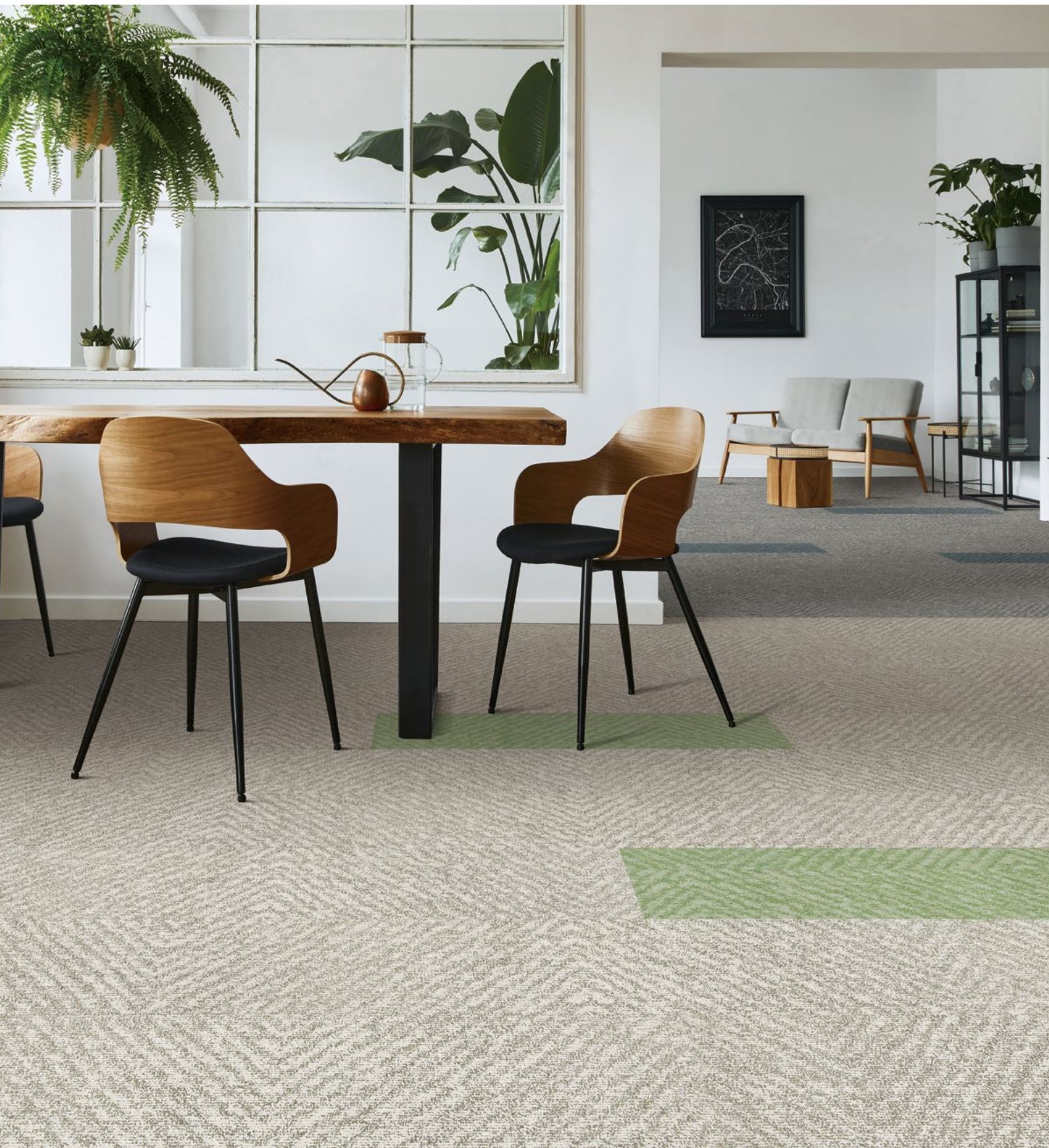
T85201 / T85204 / T85205 / T85206 Ashlar