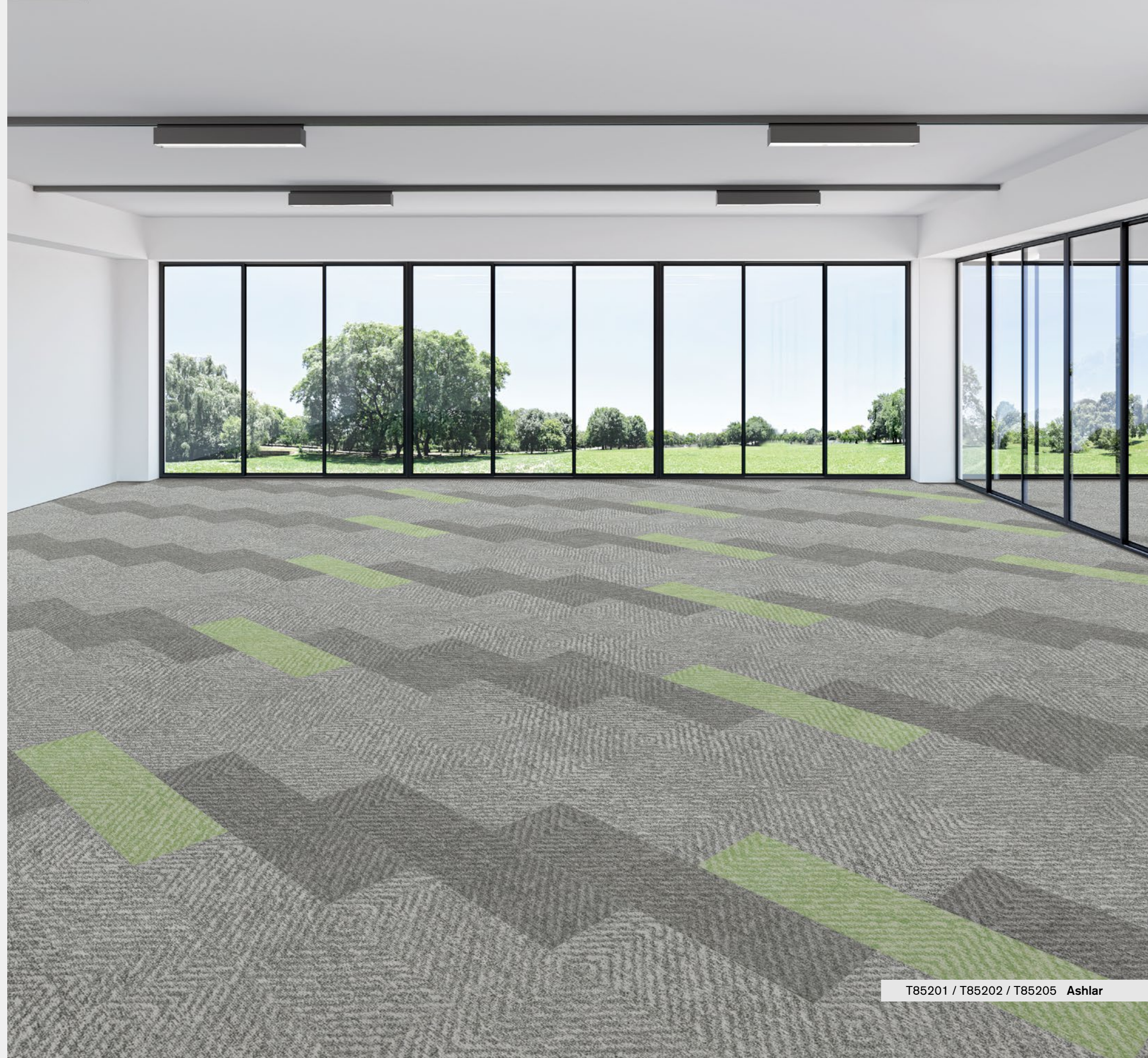
T85201 / T85202 / T85205 Ashlar