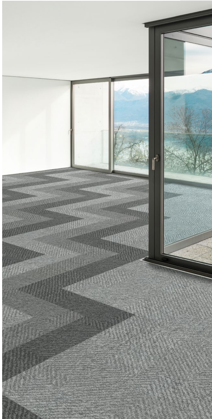
T85201 / T85202 / T85203 Herringbone