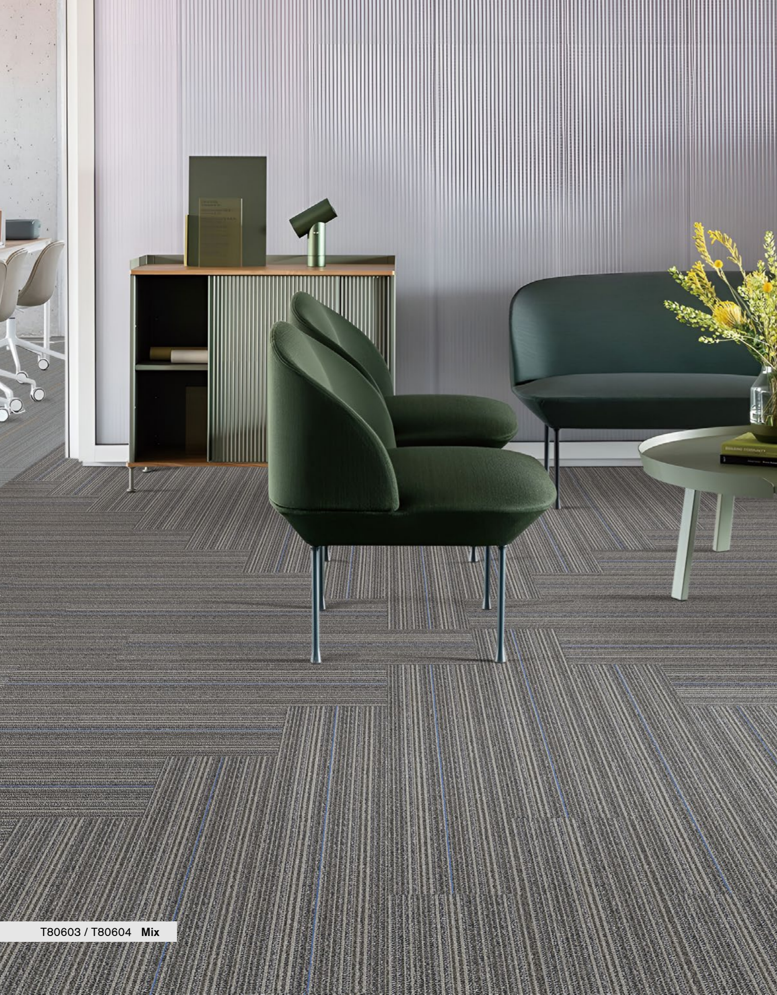
T80603 / T80604 Mix