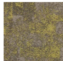
T7084G Green Apple