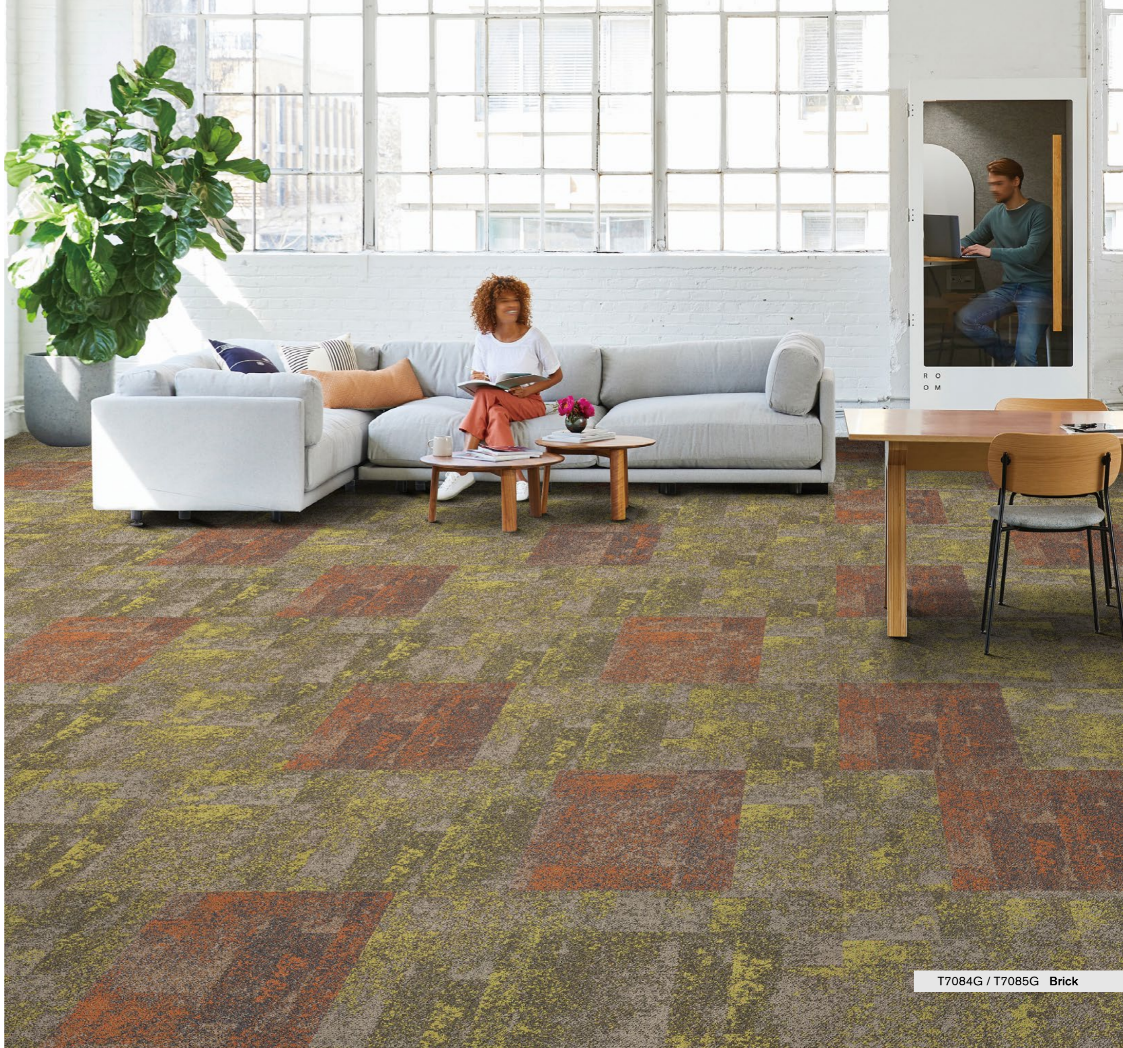
T7084G / T7085G Brick