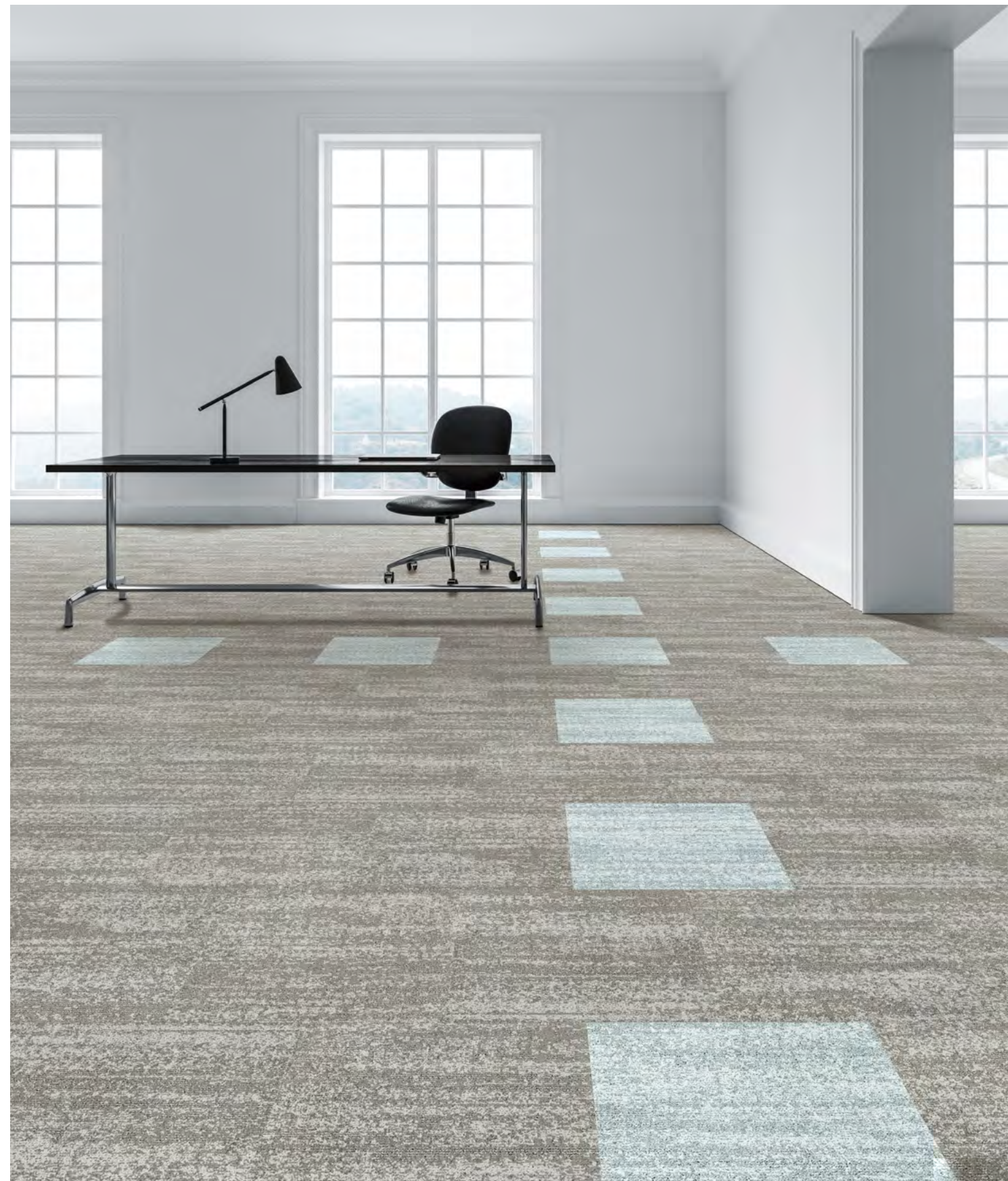
T60101 / T60105 Ashlar