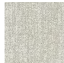
T60104 Sand Dollar