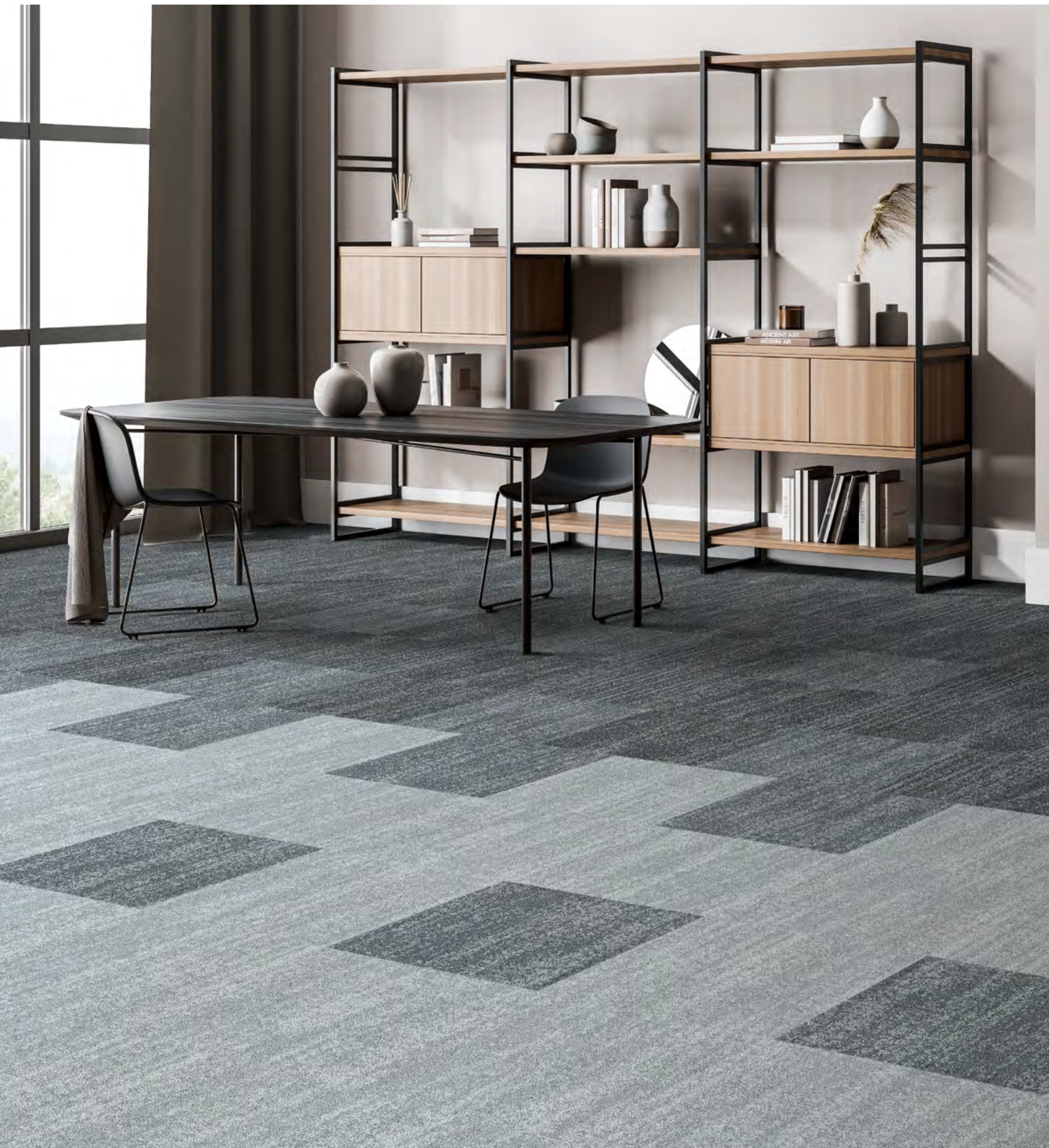
T60102 / T60103 / T60107 Brick