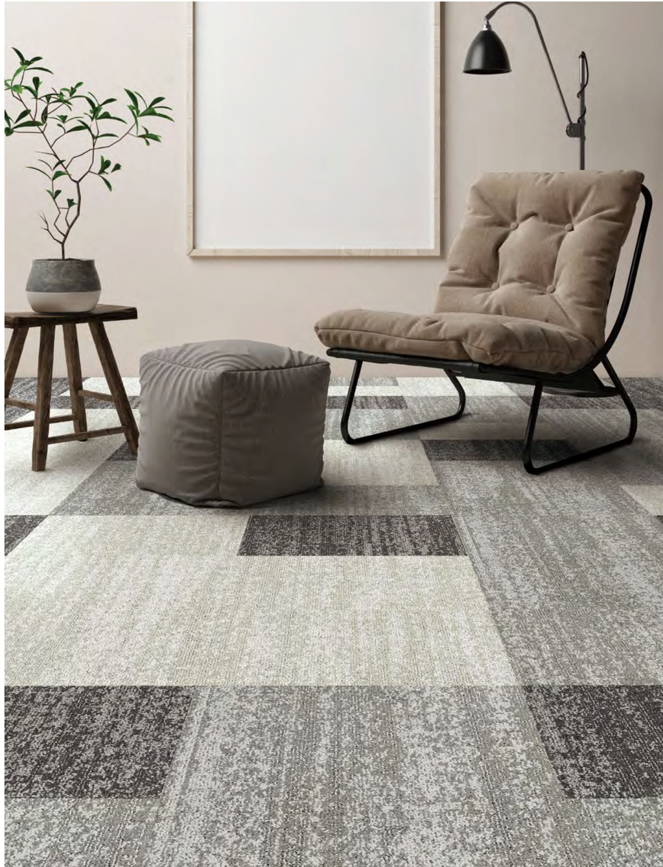
T60104 / T60105 / T60106 Ashlar