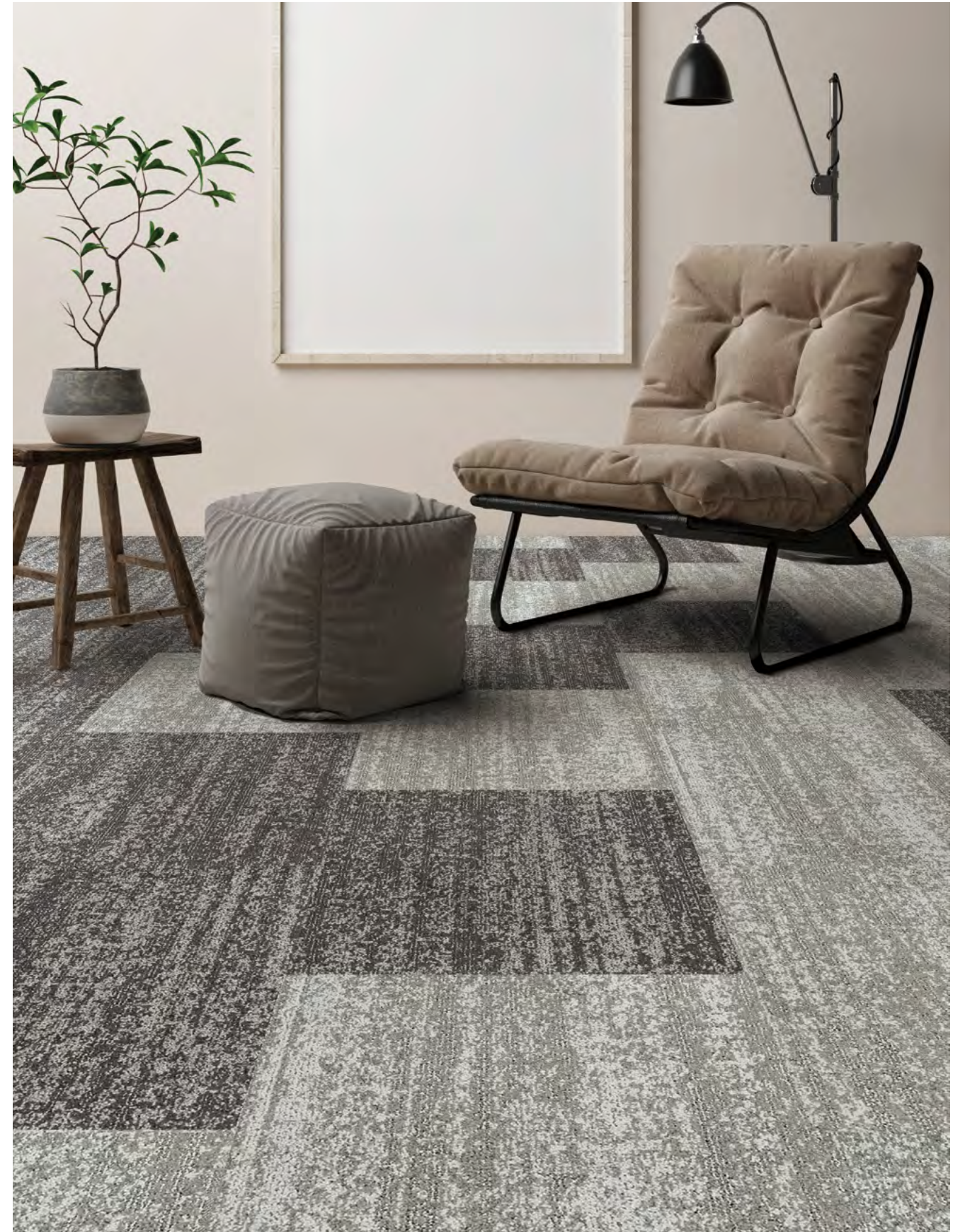
T60105 / T60106 Ashlar