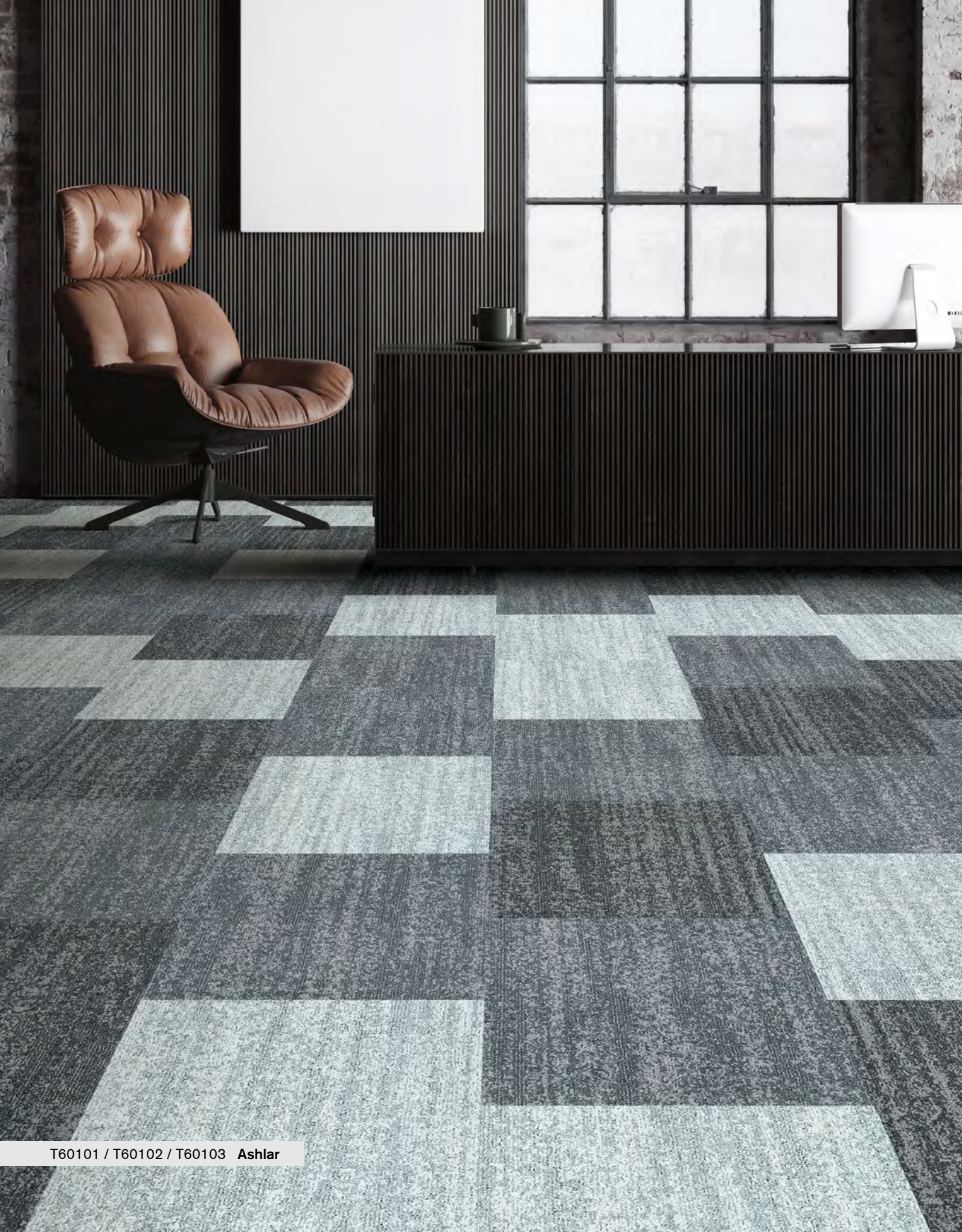
T60101 / T60102 / T60103 Ashlar