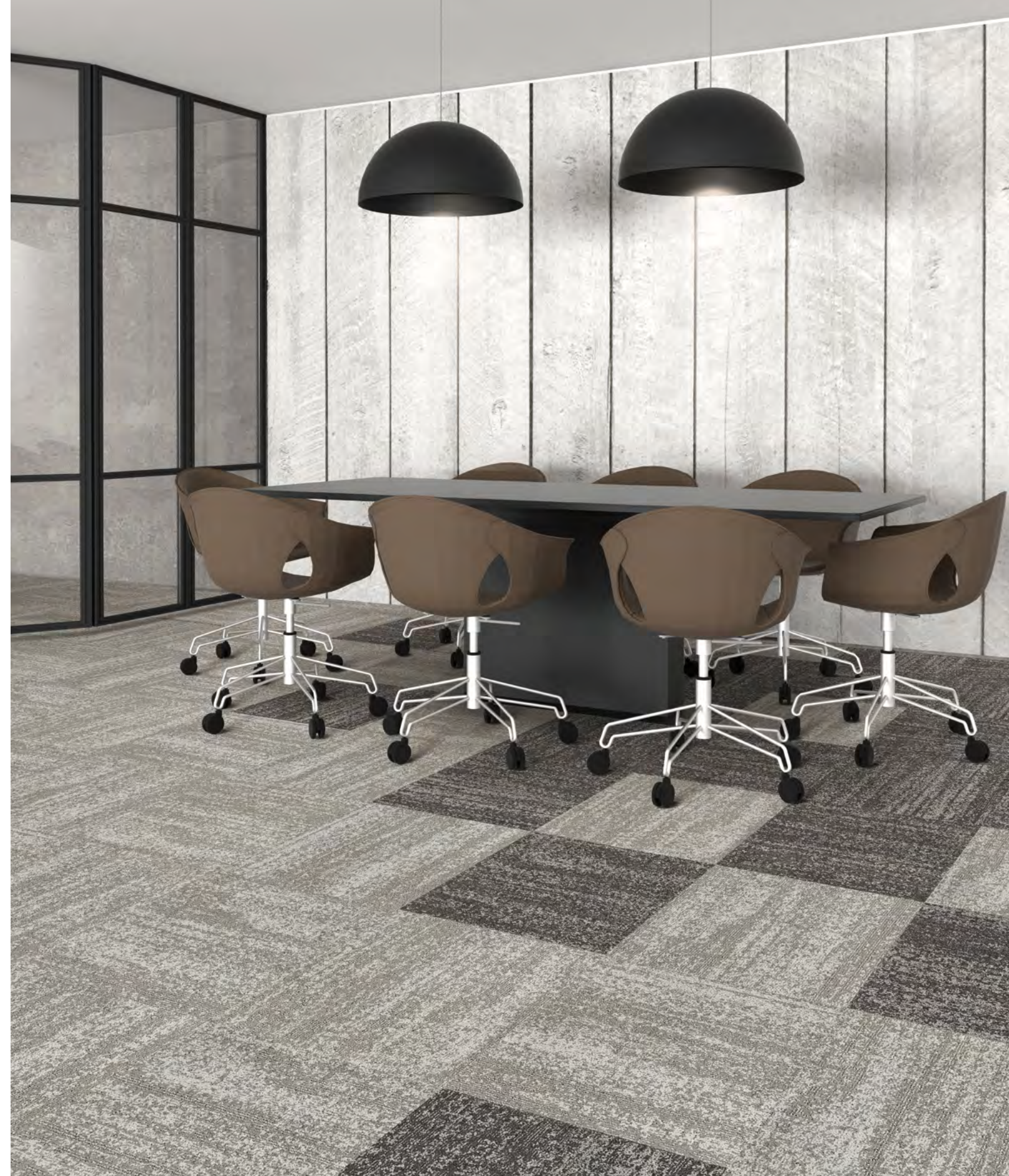
T60105 / T60106 Quarter-Turn